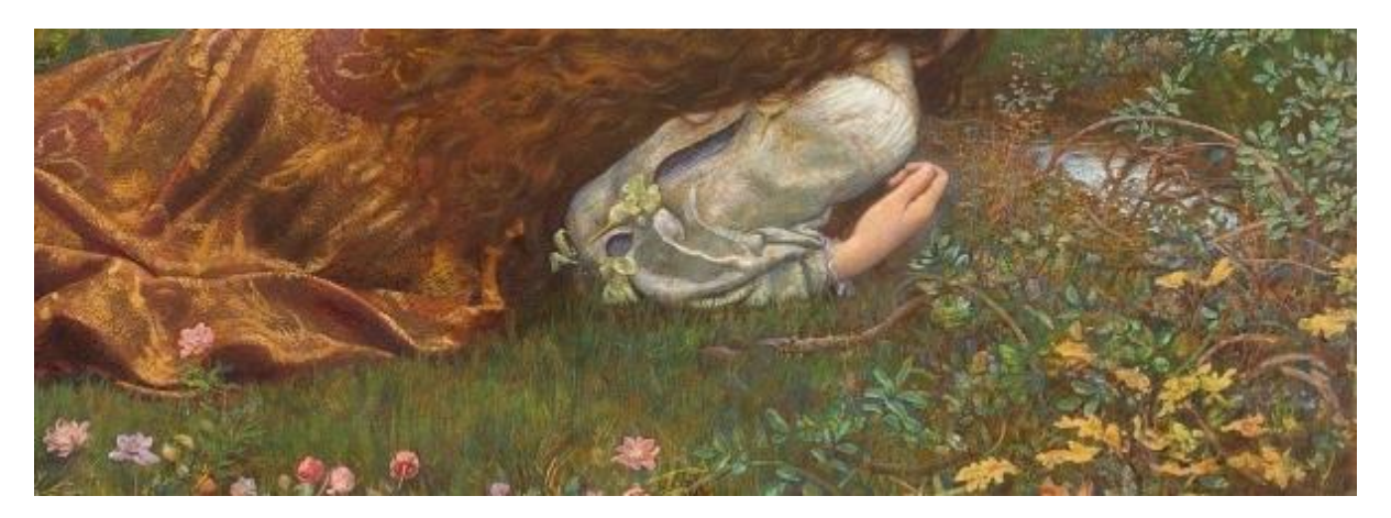
Fig. 14. Edward Robert Hughes, The Princess out of School , 1901. Gouache and watercolour, 52 x 95.3 cm (sheet). National Gallery of Victoria, detail of Fig. 1.

and gold leaves (Fig. 14). Against the cold dark foil of a shocking memento mori , she is a glowing procreative celebration of life and growth. The effect is distinctly Symbolist, deliberately suppressing narrative detail and replacing it with a simplified composition overlaid with a continuous interweaving of colouristic detail.<sup>45</sup> Like his later works that would envisage times of day, nature and the seasons as states of mind, Hughes's depiction of The Princess takes on a metaphysical, transfiguring significance. These states are expressed through colours and texture that emulate weaving and embroidery: human handicrafts, central to the Pre-Raphaelite movement, that evoke the processes of nature. Repeated and subtly modulated drifts of colour draw the fabric of the painting together, enmeshing the figure into its surroundings, highlighting the abstract effects of the work as art, and anticipating the Symbolism of his later paintings.<sup>46</sup>