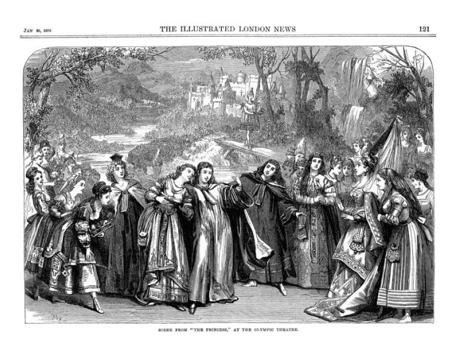
Fig. 9. D. H. Friston, Scene from "The Princess" at the Olympic Theatre, The Illustrated London News , January 1870, p. 121.

The topicality, humour and strong narrative of Tennyson's The Princess appealed to W. S. Gilbert and Arthur Sullivan who transformed it, with additional burlesque elements, into their comic operetta Princess Ida, or Castle Adamant, first performed at the Savoy Theatre in London in 1884.<sup>28</sup> Gilbert had earlier written a musical farce. The Princess (1870), based on Tennyson's poem, that responded to the continuingly controversial subject of women's higher education, with Girton College, Cambridge, the first university-level women's college in Britain having just been established in 1869. An illustration of this production for the London News depicts the important role played by the castle-university's location in a wild wood (Fig. 9).