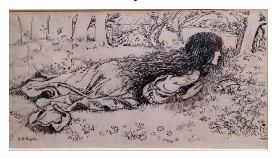
Fig. 7. Edward Robert Hughes, The Princess out of School , c. 1901. Preparatory drawing, pencil, pen and black ink on paper 26 x 42.5 cm, private collection. Image: Author.

That Hughes's princess is escaping "school" in favour of nature is confirmed above all by the hat, abandoned at her feet and prominent in the foreground. Rather than a crown, she has been wearing a small soft pill-box with up-turned folds, a distinctively scholar's cap (though trimmed with ermine to indicate her royal status). Fashionable in the nineteenth century also as a smoking or lounging cap, its origins were in the similarly shaped "biretta" given at the conferring of degrees in medieval universities. Hughes's princess has taken off her hat and lets her hair fall freely down her back, where it mingles with the brocade of her robe and beyond that with the tapestry-like pattern of flowers and plant tendrils of her grassy bank. She rejects the human constraints of learning for Keats's bower of natural delights in which she is both immersed and free. A preparatory drawing (Fig. 7) shows that the plants, flowers, tree trunks and stream were all part of the initial idea.