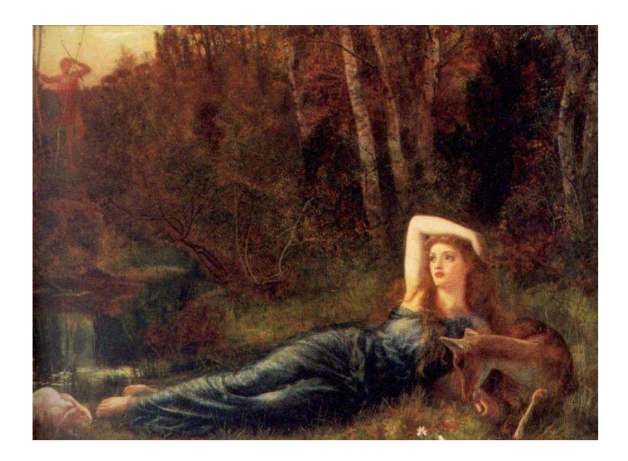
Fig. 5. Arthur Hughes, Endymion, 1868-70. Oil on canvas, 76 x 106.5 cm. Unlocated.

Does The Princess share this intentional ambiguity or does it have a more significant relationship with Keats's poem, as well as its more obvious allusion to Tennyson's The Princess ? Had Hughes formulated the visual image first, and attached the lines from "Endymion" as an enhancement afterwards, or did he intend to directly interpret the poem? In these lines Peona, sister of the shepherd Endymion, who is troubled by his love for the moon goddess Cynthia, places him to rest