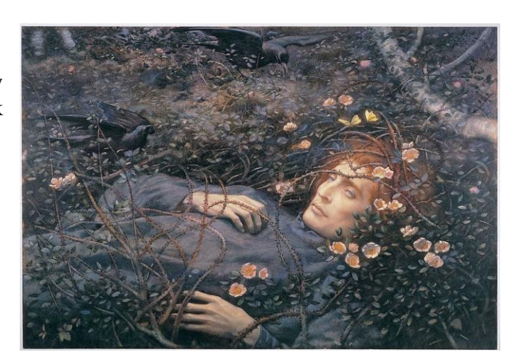
Fig. 13. Edward Robert Hughes, Oh, what's that in the hollow? 1893. Watercolour on paper, 63.2 x 93.3 cm. Royal Watercolour Society.

His version, titled Oh , what's that in the hollow? (1893) (Fig. 13), differs dramatically from the one approved by Rossetti herself, designed by Frederick Sandys, another Pre-Raphaelite associate, who focused on the narrative of the carousing couple pursuing worldly pleasures and failing to see the prostrate body of a dead woman lying beneath them.<sup>41</sup> Hughes, by contrast, concentrates on the face, hands and open eyes of the dead man who is overtaken by nature's own processes of growth and decay. The Christian moralism has been replaced with a confronting study of the effects of nature and the cycle of life.