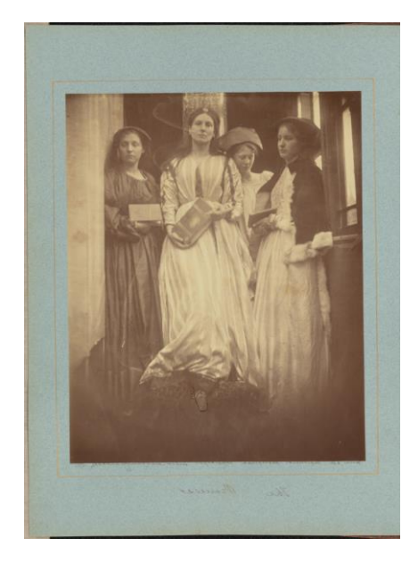
Fig. 6. Julia Margaret Cameron, The Princess, 1875. Albumen silver print, 31.5 x 25.3 cm. Getty Centre.

indicating that he intended his painting to evoke a comparable reflection on the passing of time, on "the days that are no more." The photographer, Julia Margaret Cameron, also reinterpreted "Tears idle tears" and two other poems from The Princess with theatrical and musical enactments that evoked the mythic past (Fig. 6). Yet neither addressed the issues underlying the main narrative of Tennyson's poem.