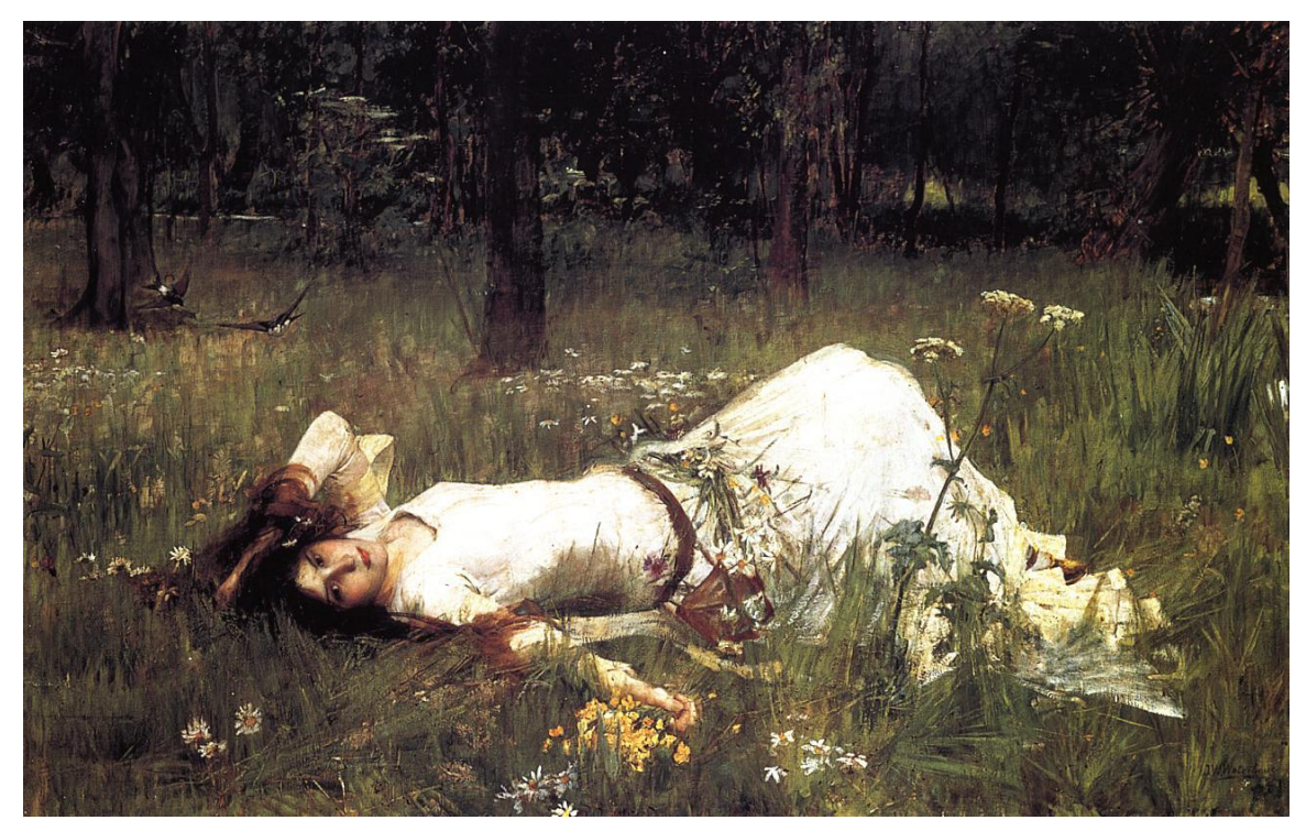
Fig. 8. J. W. Waterhouse, Ophelia , 1889. Oil on canvas 100.3 x 62.2 cm. Collection Lord Lloyd-Webber.

The topicality, humour and strong narrative of Tennyson's The Princess appealed to W. S. Gilbert and Arthur Sullivan who transformed it, with additional burlesque elements, into their comic operetta Princess Ida, or Castle Adamant, first performed at the Savoy Theatre in London in 1884.<sup>28</sup> Gilbert had earlier written a musical farce. The Princess (1870), based on Tennyson's poem, that responded to the continuingly controversial subject of women's higher education, with Girton College, Cambridge, the first university-level women's college in Britain having just been established in 1869. An illustration of this production for the London News depicts the important role played by the castle-university's location in a wild wood (Fig. 9).