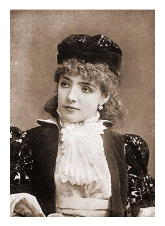
Fig. 12. Jessie Bond as Melissa in original production of Princess Ida, photograph, dimensions unknown, 1884. Web link.

Surprisingly, Princess Ida was not a runaway success, as observed by the actress Jessie Bond (Fig. 12) in her autobiography, with an explanation that reveals the widespread debate caused by its underlying issues: