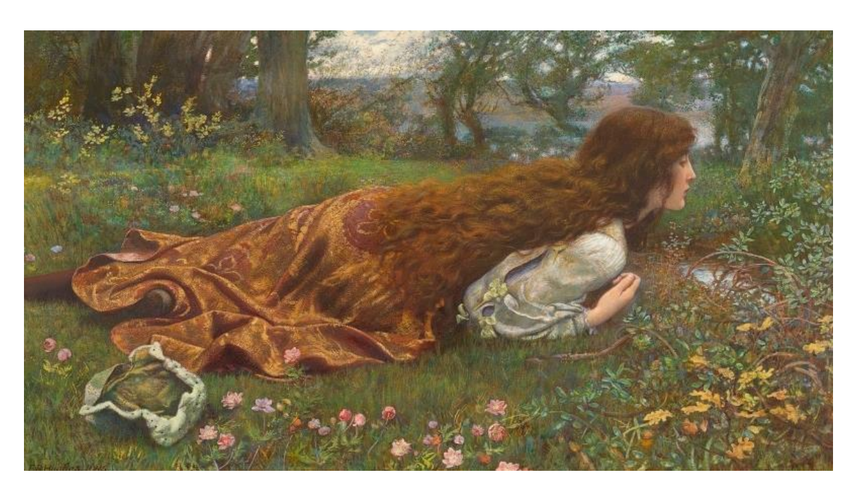
Fig. 1. Edward Robert Hughes, The Princess out of School , 1901. Gouache and watercolour, 52 x 95.3 cm (sheet). National Gallery of Victoria.

In 1901 the trustees of the National Gallery of Victoria, on the advice of the Council of the Royal Academy, acquired a large watercolour in an impressive gold frame from the current summer exhibition of the Royal Society of Painters in Water Colours in London (Fig.1). This choice reflects the high regard for this medium at the time, and enthusiasm for its potential on such a large scale, befitting its export to Melbourne. Already, a reviewer of the exhibition had declared that "It occupies what may be regarded as the place of honour in the gallery, and it is a tribute to the intelligence of the hanging committee that it is so well placed."