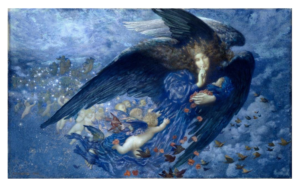
Fig. 15. Edward Robert Hughes, Night with her train of Stars, 1912. Watercolour, bodycolour with gold medium on paper, 127 x 76.2 cm. Birmingham Museums and Art Gallery, 1912.

Shadows rise. The lark sings on. The sun, Closing his benediction, Sinks, and the darkening air Thrills with a sense of the triumphing night—Night with her train of stars And her great gift of sleep. (15-16)<sup>51</sup>