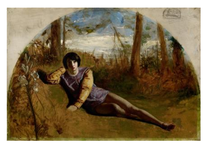
Fig. 3. Arthur Hughes, The Young Poet , 1848-49. Oil on canvas, 63.5 x 91.4 cm. Birmingham Museums and Art Gallery.

In both composition and melancholy resonance, this work invokes Joseph Wright of Derby's well known portrait of Sir Brooke Boothby , itself informed by a tradition that dates back to Hilliard, depicting figures of sensibility reclining in a contrived but empathetic natural setting. Edward Hughes's figure is a notably female descendant of these meditating figures; one in which the relationship with nature has evolved from mood-enhancing backdrop for a gentleman scholar to a nurturing environment that is actively experienced by a woman.