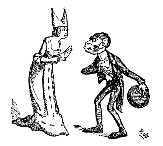
Fig. 10. W. S. Gilbert (Bab) "A lady fair of lineage high," illustration, Princess Ida, W. S. Gilbert, Songs of a Savoyard, London, George Routledge and Sons, 1890, p. 51. Web link.