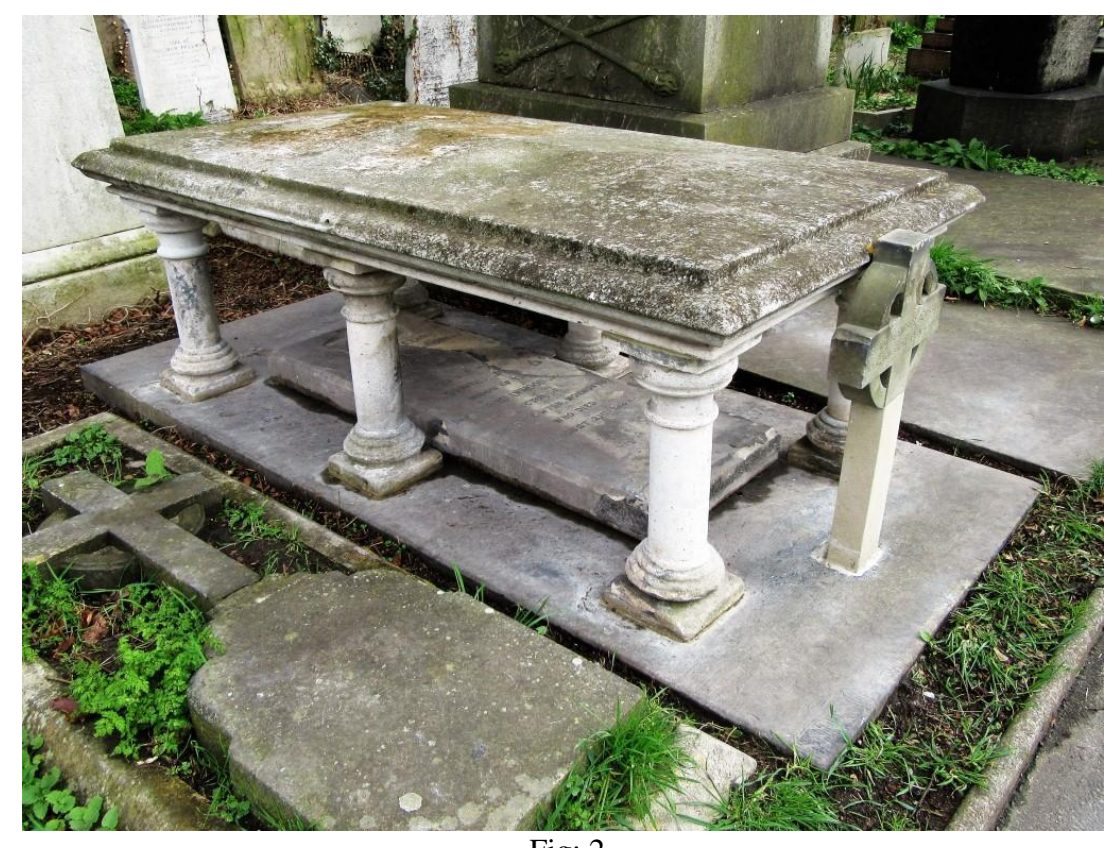
Fig: 2 Photograph of side-view of Sydney, Lady Morgan's table tomb, Brompton Cemetery, London, England. Photograph by Robert Stephenson, 29 March 2018, used with his permission.