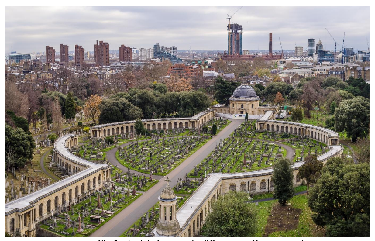
Fig 5: Aerial photograph of Brompton Cemetery, nd.

Brompton Cemetery is a Victorian landmark, located in West Brompton in the Royal Borough of Kensington and Chelsea, London, England. Brompton Cemetery was established in the nineteenth century to cope with the demands of the growing population of London. It was designed by the architect Benjamin Baud, who created what has been described as an open-air cathedral, with a broad central walkway, not dissimilar to the nave of a church (Brompton Cemetery).