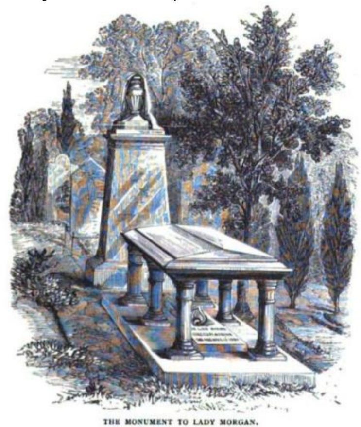
Fig 7: Sketch of Lady Morgan's tomb by Samuel Carter Hall, 1871.

The inscriptions for each of the women in the Morgan grave are relatively simple in contrast to the table tomb constructed over the gravesite.<sup>4</sup> There was also a memorial sculpture commissioned by Morgan's niece, Sydney Inwood-Jones, atop the slab beneath the canopy of the table tomb. The sculpture was executed by Mr. James Sherrard Westmacott.<sup>5</sup>