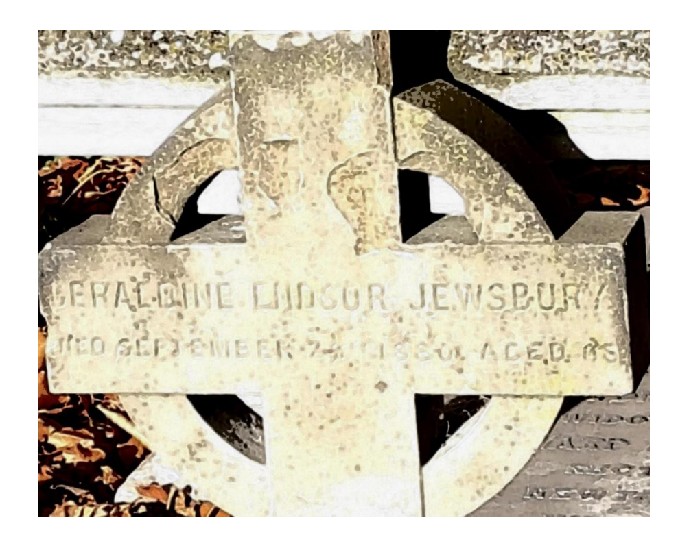
Fig: 3 Photograph of Geraldine Jewsbury's marker, Brompton Cemetery, London, England. The photograph illustrates the conservation work carried out on the Morgan table tomb in 2018. Photograph by the author, 11 November 2019