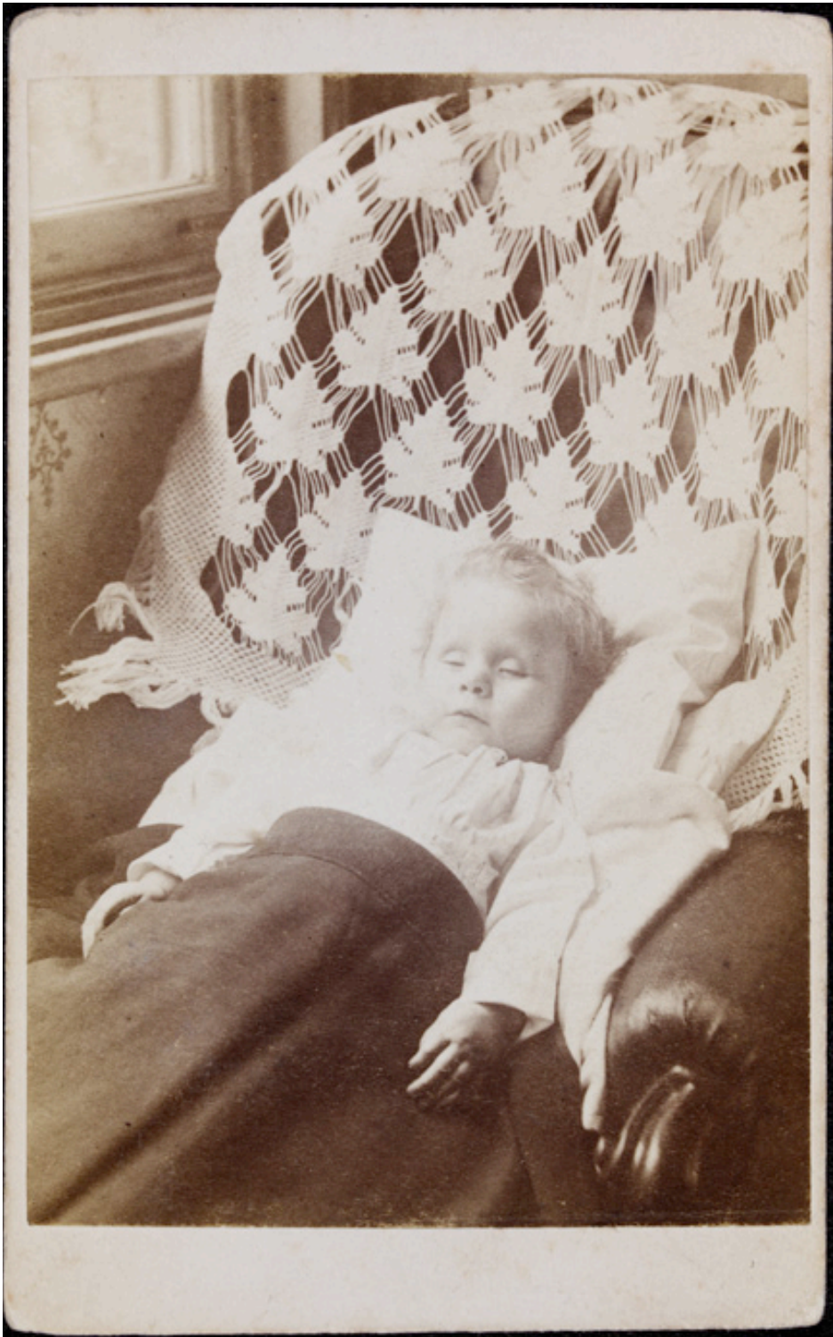
Figure 1: Alfred Owen Laid Out After Death (London, Victoria and Albert Museum)