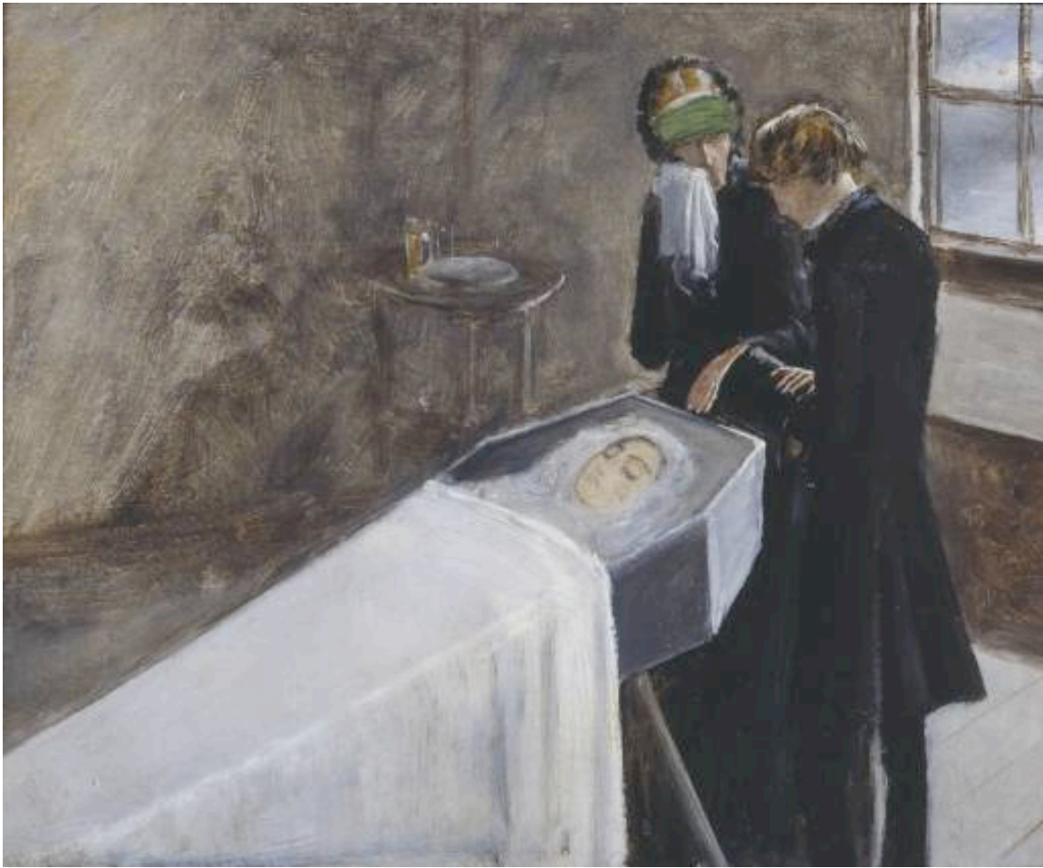
Figure 2: John Everett Millais, The Artist Attending the Mourning of a Young Girl

The image of Alfred is small: cartes-de-visite photographs were mounted on pieces of card only 2.5 x 4 inches large. The carte-de-visite photograph was developed in the 1850s by Antoine Disdéri, whose invention of a camera that could take multiple images on one plate led to the a huge reduction in the price of photographs. Cartes de visite were so-called because their size was close to that of a visiting card, but they were most often collected and placed in albums. Cartes attained a huge popularity through the 1850s and 60s, when photographs of the famous sold commercially for as little as one shilling. Studies of the carte-de-visite craze often focus on this aspect of carte photography, yet it was also hugely popular for family portraiture, largely because it was so cheap. Cartes-de-visite, and their slightly larger successor, cabinet photographs, were collected into family albums and recorded family members and occasions such as christenings and marriages (Newhall 64-71). Historians of family photography such as Audrey Linkman have noted that post-mortem photographs are only very occasionally found in such albums as survive, although there are suggestions that post-mortem portraits may have been circulated among friends and relatives in the same way as other carte-de-visite or cabinet portrait photographs were (Linkman 342-7). The lack of pictures of the dead in