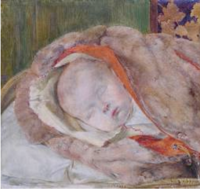
Figure 3: William Windus, Portrait of a Dead Child, the Artist's Son

waistcoat he is wrapped in underneath the coat, and which curves round his head, and in the green wall behind the piece of inlaid furniture to the right. The child's face is at the centre of the image, and the swathes of cloth and coat wrapping him serve to frame it, directing the viewer's gaze to its tiny features. The picture is intensely poignant: the chill of death is emphasised by the fur coat and the contrast between the child's closed eyes and pale skin and the luxuriance of the fur and fabrics surrounding him. The picture must have been painted, or at least started, in the first hours after death, so in one sense its point is the intensity of grief to which it gives visual form. Yet there is also an aesthetic at work here, for the careful arrangement of contrasting colours and textures surrounding and framing the dead child's face emphasise that we are meant to find it beautiful: not only the picture, but also the dead child.