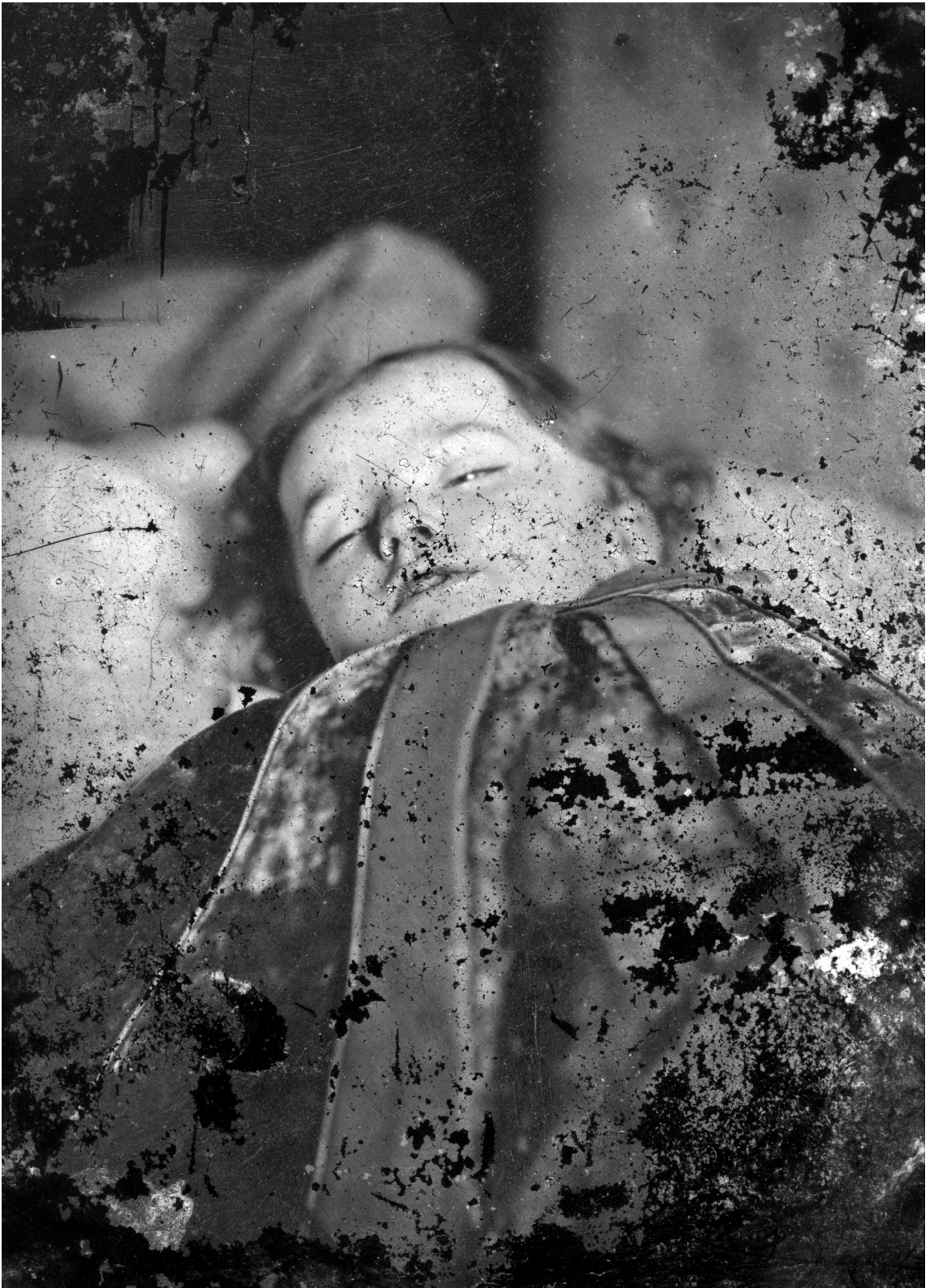
Figure 4: John Thomas, A Dead Child (Aberystwyth, National Library of Wales)