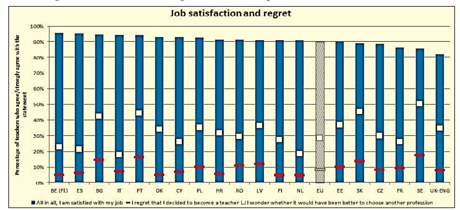
Figure 2: Job satisfaction and regret statistics within pre-service teachers