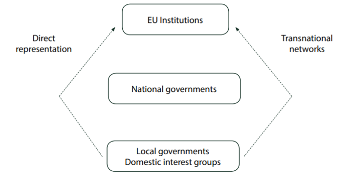
Figure 1: Bulkeley et al., 2003, p. 238 as adapted from Fairbrass & Jordan 2001, p.501

Type II (Figure 2 below), also called a 'polycentric' approach, unlike the hierarchical vertical model, considers multiple governing authorities at different scales, leads to the disappearance of vertical structures and hierarchies. Different levels and forms of governance are now interacting in more complex overlapping, dynamic and flexible networks.