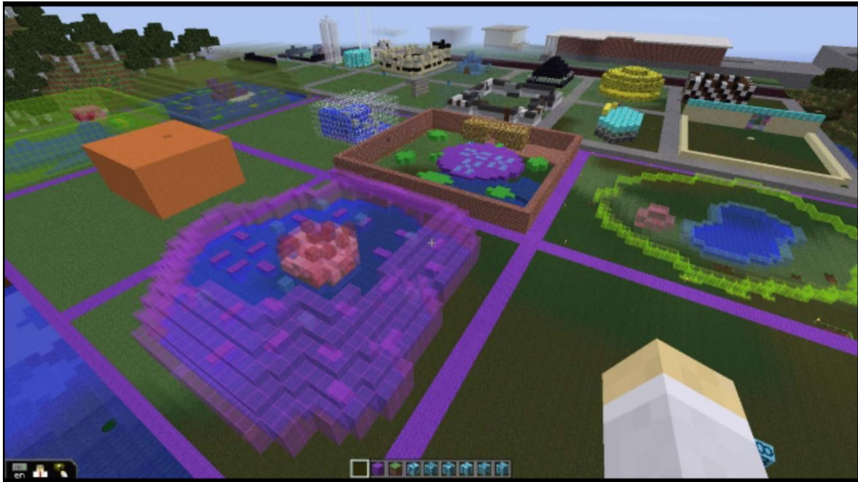
Figure 2. Screenshot showing student models of a plant or animal cell. All cell organelles were required to be labelled with their functions described in a signpost.