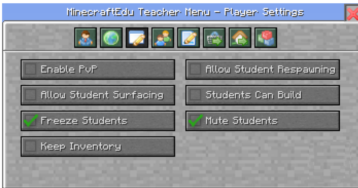
Figure 4. Screenshot of the teacher menu showing some of the additional teacher controls, such as freezing student movements and building control.

The MinecraftEdu website (Teacher Gaming LLC, 2015) provides a range of resources for teachers including forums, downloadable worlds made by other teachers, and technical support. However, it can be difficult to locate resources that match specific learning goals or curriculum points given that the use of MinecraftEdu in science is relatively new. The absence of pre-built worlds requires teachers to invest some time into designing activities for their students to complete in MinecraftEdu . Teachers also found that they could obtain important feedback regarding student learning within the MinecraftEdu worlds directly from students during each lesson, directing improvements for subsequent lessons.