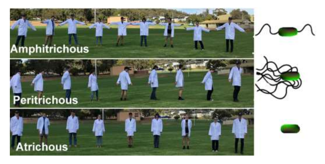
Figure 1: Students demonstrate how to dance like bacteria! Bacterial diagrams showing flagellar arrangement on the right.

Motility is an important attribute of certain bacteria and underpins, for example, their dispersive ability, colonisation and infectivity (Moens & Vanderleyden, 1996; Haiko & Westerlund-Wikström, 2013). Those bacteria that can swim have hair-like motile attachments called flagella. The bacteria move with a characteristic 'run and tumble' motion with the run being movement, for example, toward a food source and the tumble being a check of where they are in relation to the stimulus. Different species of swimming bacteria have differences in the placement and number of flagella; for instance, the well-known gut bacteria, Escherichia coli , is peritrichous having flagella around its cell body (peri-around, trichous – hairs). We teach the students about other types of flagellar arrangement: Monotrichous: a single flagellum at one end of the cell; Lophotrichous – a tuft of flagella at one end; amphitrichous – a flagellum at each end; atrichous –without flagella.