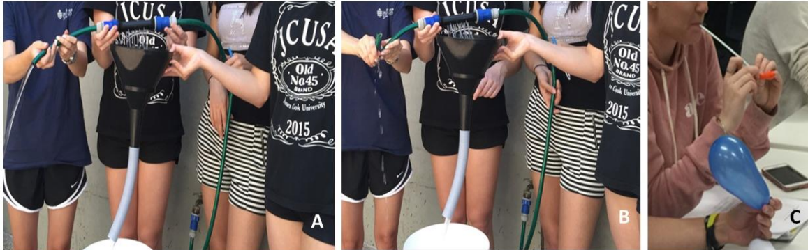
Figure 1: Simulations

simulation of glomerular filtration was achieved utilising garden hoses, irrigation filter cartridges with holes, and various buckets – performed outside, for obvious reasons (Figure 1A & B); and simulation of airways restriction by inflating balloons through straws (Figure 1C). Performing these simulations required input from students, based on their understanding of the concepts.