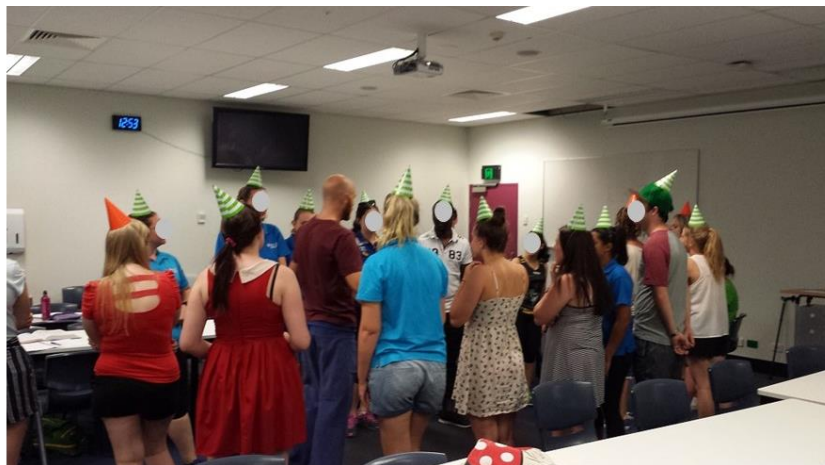
Figure 3: Role-plays

Groups of students produced posters addressing short case studies. More than one group worked on each topic and the posters produced were quite diverse, even though the topic was the same. A, B and C illustrate the range of posters for the same topic.