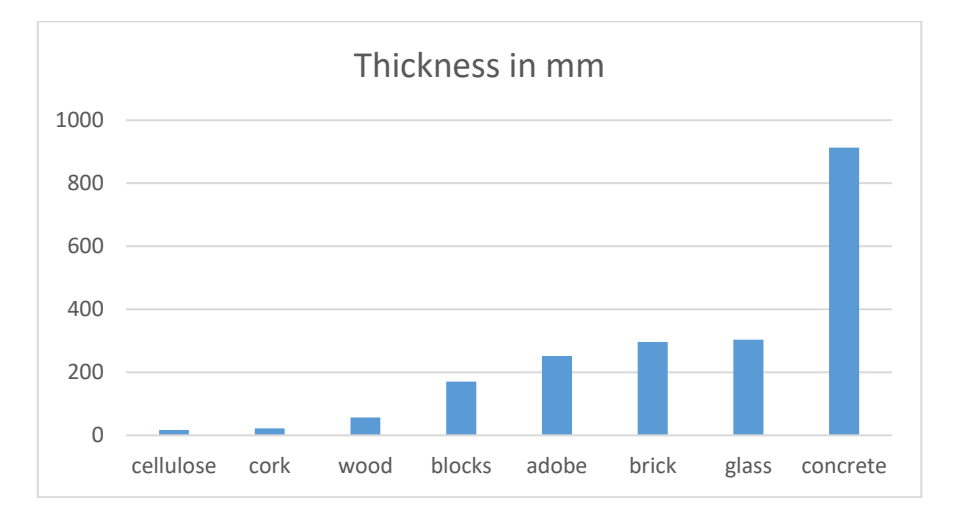
Figure 1. Comparing the insulating ability of the materials related to their thickness

The required thickness of materials to obtain the same effect of thermal insulation (Fig. 1):