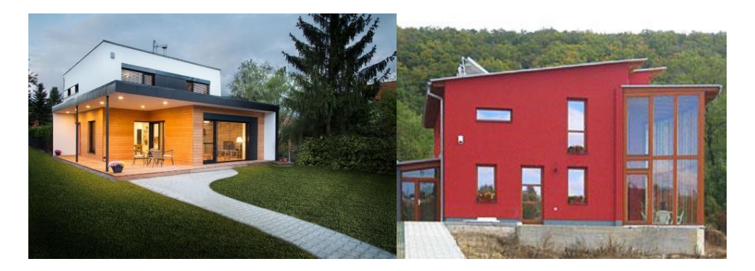
Figure 3. Low-energy house (https://www.living.cz/predstavujeme-nejlepsi-domy-ceskavyberte-viteze/24/)

Topics for discussion: The parameters of low-energy houses (Fig. 3), heat pump, excursions around the residential area - where and what kind of houses to build? (low-energy, classic, timber). Materials for the construction and their physical and technical characteristics, etc.