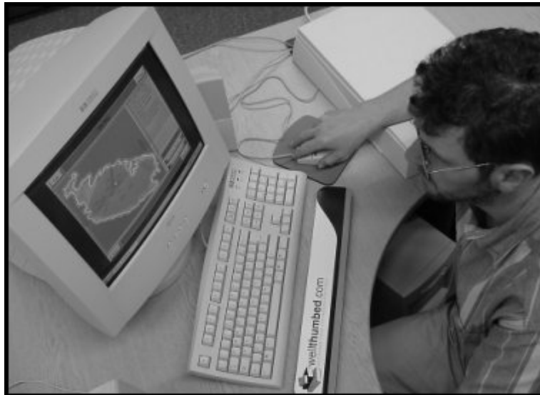
Figure 2. Working through Field-Sim

One of the scheduled pre-field course briefings was held in a computer suite. This allowed student evaluation of Field-Sim to take place whilst in use. During this session both the developer and lecturer were present. From a development perspective the rationale behind the evaluation was to focus on the two areas of concern: (i) navigation and (ii) the textual introduction. Some of the pages in the project section were rather complex but could not really be simplified by defeaturing. Therefore, navigation had to be evaluated to ensure it was intuitive. The textual introduction needed to be assessed to ensure the right level and quantity of information. The evaluation methodology used was observation, followed by a structured interview/questionnaire.