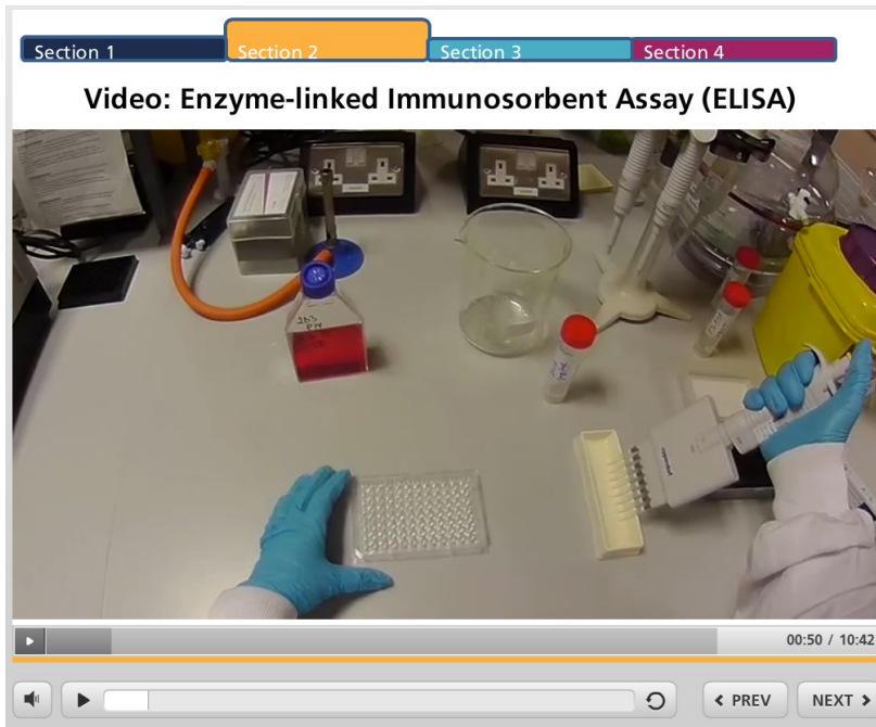
Figure 1. Screenshot from the ELISA video.

The main purpose of the video was to demonstrate the immunoassay technique to students. To enable active listening and to encourage students to refer to the content of the theoretical material, an interactive exercise in the form of a question appeared automatically at 6 minutes 57 seconds. This question appeared at the same time as a verbal prompt from the academic. The learner was required to answer the question correctly in order to proceed with watching the video. This interactive element of the video was created using Articulate Storyline software. The multiple choice question asked learners to identify what type of ELISA was being performed and offered four options as shown in Figure 2. When students clicked the (correct) Indirect Elisa option, the video continued and the audio narration confirmed the right answer.