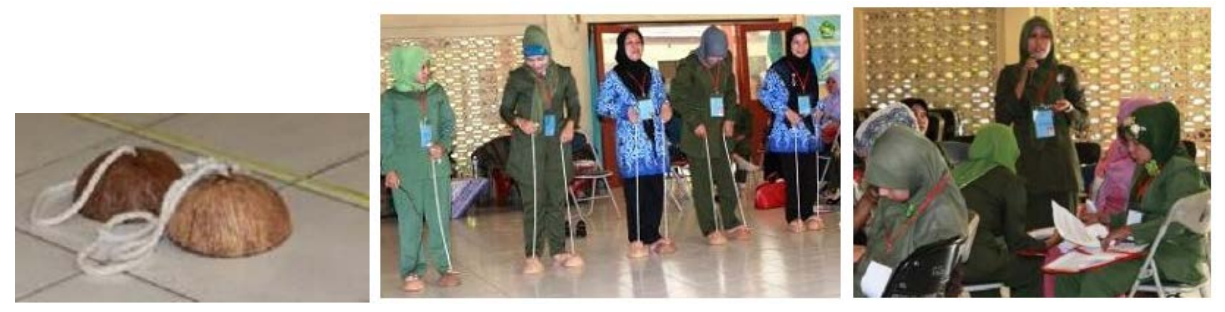
Figure 6. Playing traditional games as context supporting thematic instruction is introduced in a PMRI workshop (the photographs were taken from a local PMRI workshop in Palembang city, 2013)

Having idea about the characteristics of PMRI workshop, we also argue a potential finding which might be useful for sustaining PMRI programs in Indonesia. Starting to design a mathematics lesson using certain context by applying characteristic of intertwinement is useful for teachers as a starting point to implement current curriculum in elementary school. Regarding the implementation of the current curriculum in Indonesia, mathematics learning in elementary class uses integrated thematic instruction, that is an integrated learning that use certain theme by linking several subjects so as to provide meaningful experiences to students. Thus, PMRI workshop supports the implementation of the curriculum. On the workshop in which we were involved as facilitators at Palembang city, for example, we used a theme 'playing' for the topic of length measurement for grade 2 to link some basic competences of several subjects such as bahasa Indonesia, art and culture, and certainly mathematics itself. Here, teachers learned bahasa by writing their ideas on the worksheet and presenting ideas through presentation and they also learned arts and culture by investigating a variety of traditional games from Indonesia as well as utilizing unused goods as stuff for creating useful thing.