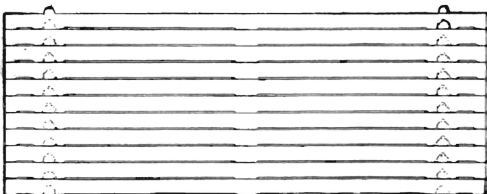
Elevation and plan of Patent Inter-locking Fire Bars.