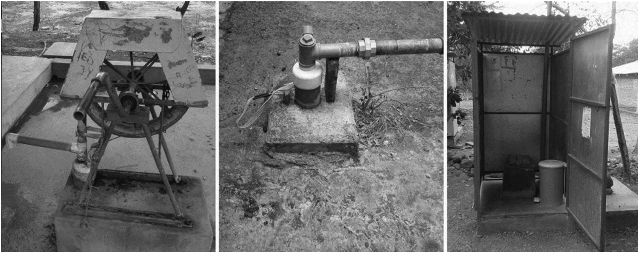
Figure 1. The three primary WatSan technologies in Darío. Rope and electric pumped wells (left and middle, respectively) and ventilated improved pit latrine (right).

the weighted network the communication link was intended to represent a level of efficacy for resolution. As such, in addition to asking interviewees who they spoke with in the event of a problem, they were also prompted to categorically score the time it took to typically resolve the problem, the frequency in which the WatSan technology typically breaks down, and to present their opinion on the utility or efficacy of the communication with said stakeholder. For time, a higher edge score was given for a shorter duration of time to resolve the issue, where the scores were (4) – days, (3) – weeks, (2) – months, and (1) – years/never. For frequency of break downs, a higher score was given for a lower frequency, where the scores were (5) – hardly ever, (4) – yearly, (3) – monthly, (2) – weekly, (1) – daily. For the stakeholder’s opinion on efficacy, a higher score was given for a more favourable level of efficacy from (4) – very good, (3) – good, (2) – mediocre, and (1) – not good at all. In this way, it was possible to construct weighted networks representing aspects of WatSan resolution efficacy.