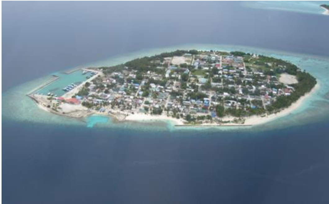
Figure 2: Island shot taken from a seaplane

The study of the surrounding context was designed to provide details of the mesosystem context and elucidate conditions in the school regarding the introduction and use of active learning and the factors supporting its use. The study took place on a local fishing island (Figure 2), referred to as the Research School. It was selected as offering optimum conditions for implementing the intervention because of their proactive approach in implementing CFS. Therefore, the characteristics of this school are of interest in the context of explicating the factors that have influenced reform. It is an Atoll Education Centre, hence the education hub for the atoll. It offers two phases of primary education (Grades 1-4, also referred to as CFS grades) and Grades 5-7 (subject-based teachers) and secondary classes offering O and A-level education.