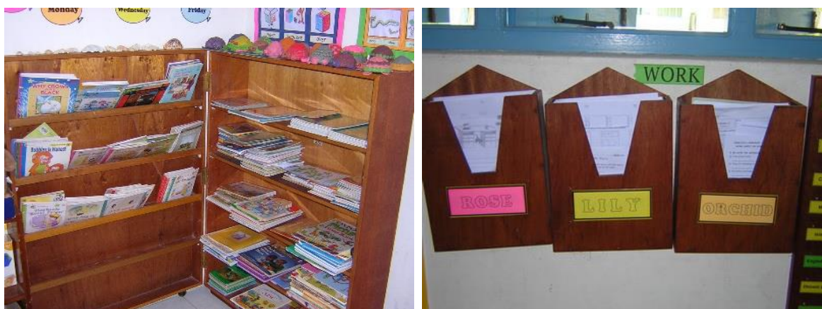
Figure 2: Classroom resources for CFS classrooms

Parents were involved in bringing about changes to the physical appearance of the classrooms by building resources and furniture (Figure 2). These visible changes were signs of a different approach to teaching in the school community (SMT3). Parents could see that established routines were being altered and appeared open to the introduction and application of new methods. The physical changes, it would seem, were necessary at the start of the change process as an indication that the status quo was shifting. One member of the SMT, working with non-CFS teachers noted, “The main thing I found is that the classroom set-up is the main problem” (SMT4). He believed that maintaining the traditional classroom set-up sustains a certain mindset with parents which presents difficulties when promoting pedagogical change.