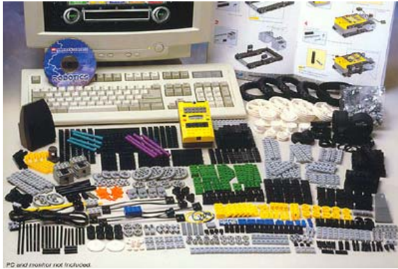
Figure 1. Lego Mindstorms Robotics Invention System.

University, USA (2003). RoboLab has in-built functionality: programming language and datalogging capabilities. The programming language is based on a flowchart programming approach. It can be customised to cater to different student level, hence its intended users can range from primary school pupils to professional roboticists. The programming functions include if-then statements, loop management, linear variables, abstract variables, concurrency, multitasking and real-time communication protocol with the RCX. In addition, it is capable of realtime vision and image processing.