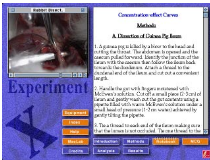
Figure 2. One of the packages with the QuickTime movie in the top left-hand corner of the screen.

In Physics, the commercial virtual instrumentation package LabView (National Instruments) is used by students to construct “programs” which control the equipment they use for monitoring circuits in an electronics lab. They make their lab experience more efficient while learning up-to-date techniques in instrumentation and control.