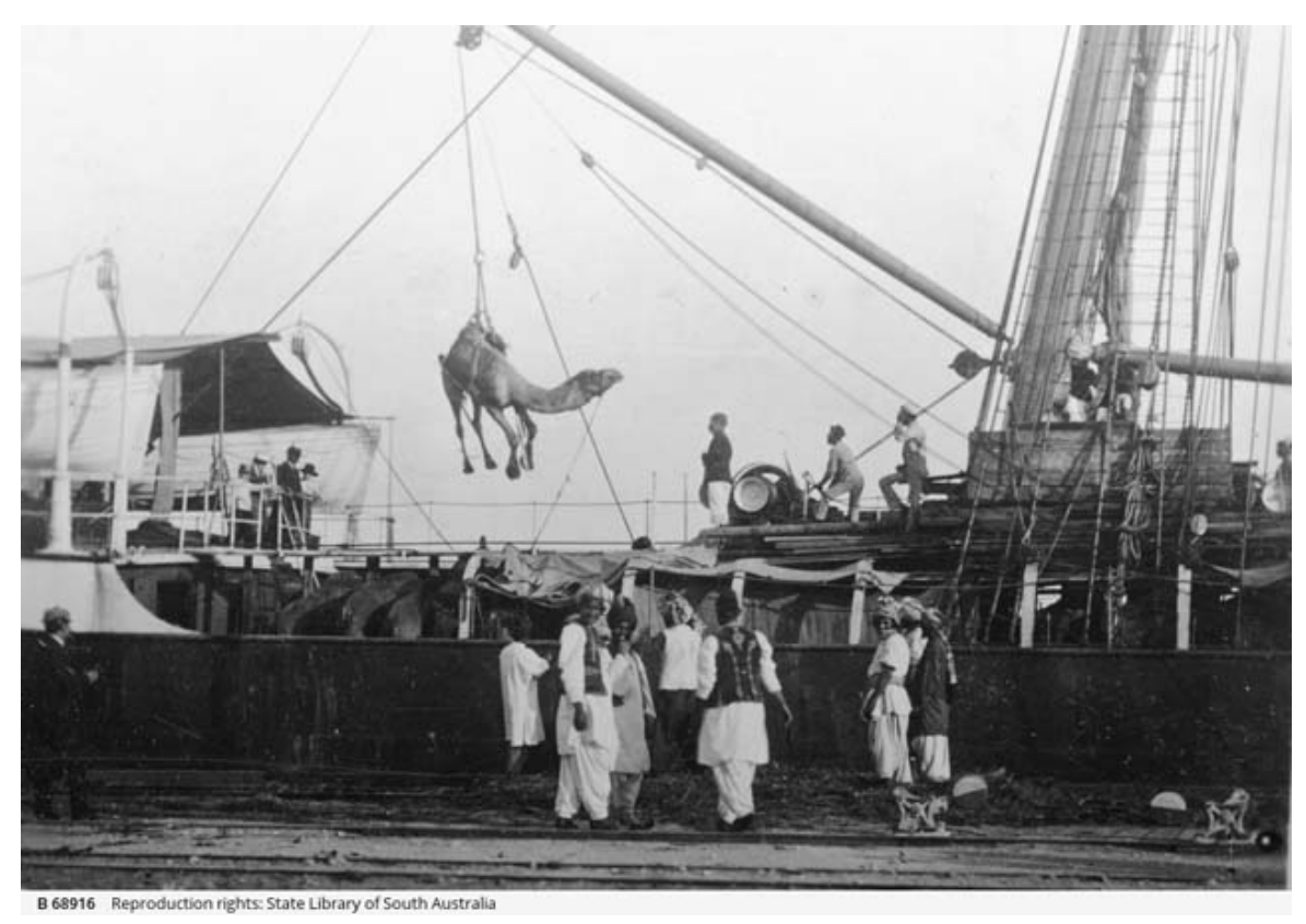
Fig. 3. (1893) "Unloading camels at Port Augusta [B 68916]."

In my project, the decision to include or exclude images of Indigenous Australians with camels posed challenges. For this narrative, following Ambelin Kwaymullina's claim that "silence does not always exist to be filled; sometimes it should be interrogated" (this quotation is one of five that open the narrative), I debated whether or not these images should be included. Following the protocols for using First Nations cultural and intellectual property in the arts ("Protocols"), I requested permission from the various archives and was advised simply to include a warning at the beginning of the work. Even as I did so, I debated my own agency or authority to "fill" a respectful void of silence. Yet the exclusion of these images likewise seemed inappropriate. As I wrote in A Condensed History of Australian Camels: "To not include is to disregard. To include is to assume. In a world of saturated media and information, in these constructed, meta-fictional, hyper-alert times, should respect be given to inclusion or silence?" My solution was to write a metafictional piece about the archival image, and about my decision not to tell a particular narrative. This non-story of an Indigenous man with two camels towing a dead horse was expressed in my project this way: