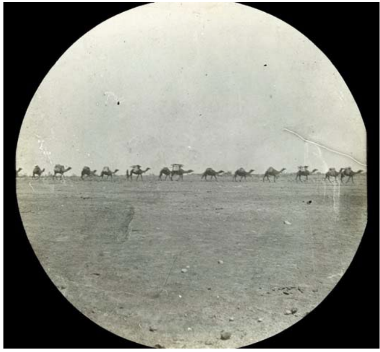
Fig. 2. (1898) "Camel train crossing the desert." Lantern slides of the Burke and Wills Expedition, MS 13867, Accession# MS13867/51. State Library of Victoria, Melbourne, VIC.

While the maximalist novel may convey the superfluity of the archive, in order to allow the reader to navigate their way out from under its weight, the archive must be lightened. Calvino defines lightness by its binary opposite: weight. One of Calvino's reasons for treasuring lightness is a desire to write in such a way as to represent his own era. In contrast to Medusa's stare, Calvino argues that writers should be light like Perseus atop Pegasus. This is not to suggest that a writer should negate or ignore the world's weight. Like Perseus, who beheaded the Medusa, the writer should be light without negating or neglecting weight. This is what I have attempted with this project—to take the weight of the archive and to lighten it by tracing it with quickness. Quickness, like lightness, is one of the values treasured by Calvino. Through this "camel train" of images, I suggest that a quick "route" through the Australian archive may be established.