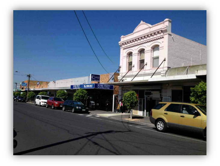
Shop – 139 Wheatsheaf Road, Glenroy.