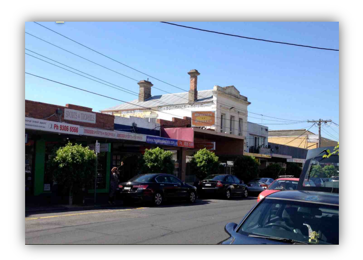
Shop – 92 Wheatsheaf Road, Glenroy.