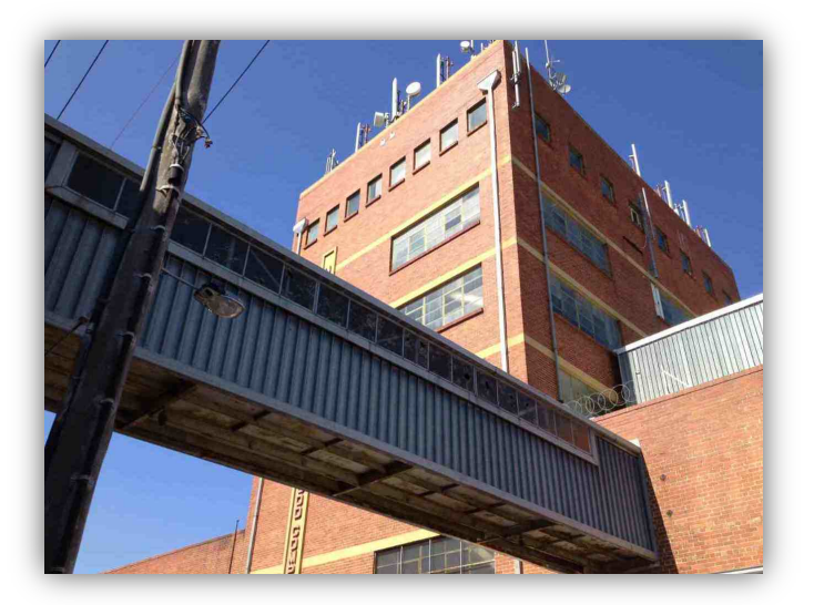
Hutchinson's Flour Mill: this red brick tower was built between the 1930s and 1940s, but its grain silos were demolished in the mid 1980s.<sup>14</sup>