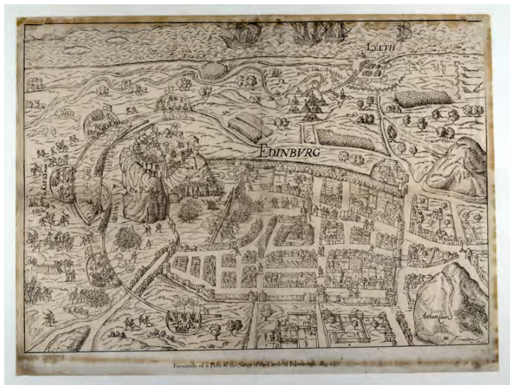
Figure 1: Bird's-eye view of the siege of May 1573 from Holinshed's Chronicles . The prominent, three-tiered structure above the Spur is David's Tower. The Constable's Tower is to its right, the Fore Wall Battery between the two.

of the siege depending on one's viewpoint, was certainly at enmity with two of the regents, Lennox and Morton, but John Knox, Minister of St Giles and the main spiritual and moral force behind the supporters of King James, yet seems to have retained a liking for Kirkcaldy and a hope that he would see the errors of his ways.