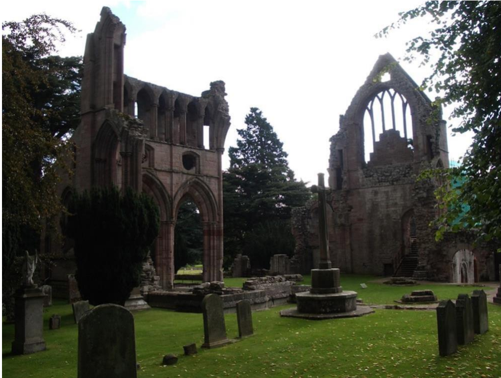
Figure 2. Dryburgh Abbey photographed by Donald Barrett, 1 October 2006.

novelist Sir Walter Scott (1771-1832), one of the most significant innovators in the creation of ‘Scottishness’, and of “Field Marshall Sir Douglas Haig, commander of the British forces on the Western Front from 1915 until the end of World War I.” 36 Haig is a divisive figure in the twenty-first century, but the combination of Scott’s literary reputation and Haig’s high military standing, magnified by the beauty of the ruins and the fact that an earlier Celtic monastery occupied the site makes Dryburgh Abbey a marvellous candidate for heritage marketing. 37