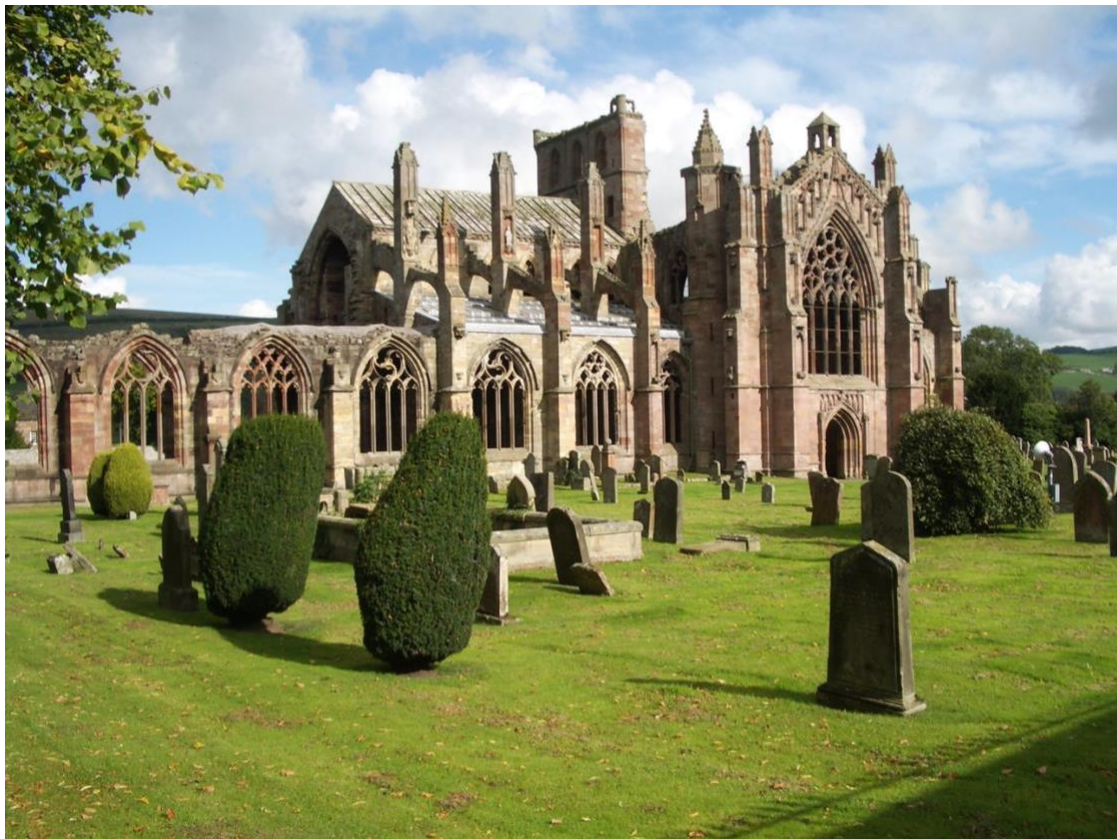
Figure 1. Melrose Abbey, photographed by Donald Barrett, 1 October 2006.

This study analyses the discourses of history, tourism, and identity that are used in the marketing of the Border Abbeys Way, a 68 mile (109 kilometre) heritage walk which was opened in 2006. The Border Abbeys Way is one of Scotland's Grand Trails, and winds between the Tweed and the Teviot Rivers. It intersects with three other long-distance walks: the Southern Upland Way; Saint Cuthbert's Way; and the Cross Borders Drove Road. 2 The featured medieval churches that give the walk its title are Melrose Abbey, Dryburgh Abbey, Kelso Abbey, and Jedburgh Abbey. These great churches were all built during the reign of King David I of Scotland (1084-1153, reigned from 1124), the youngest son of King Malcolm Canmore and Queen (later Saint) Margaret, his Anglo-Saxon wife. David spent much of his youth in the court of his brother-in-law, Henry I of England (who married his elder sister Matilda of Scotland), and wished to bring Scotland into the international church structure and governmental culture he encountered in England.