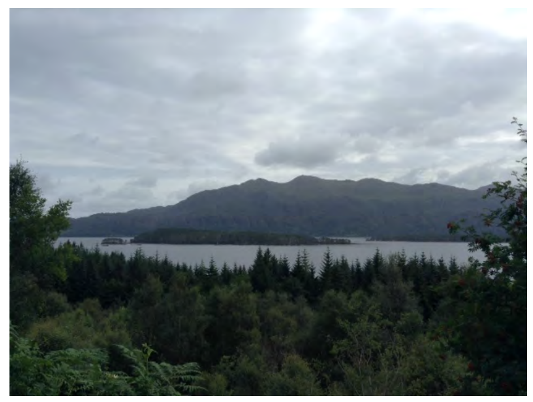
Loch Maree.