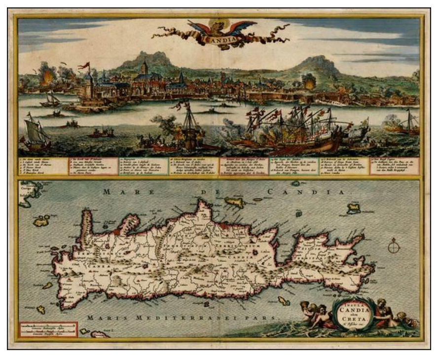
Figure 2: The Venetian Protectorate of Candia (1651) published in Marco Boschini, Il regno tutto di Candia. Delineato a parte et intagliato (Venezia: con Privileggio nelli Stati della Chiesa, e della Republica Venezia, 1651).