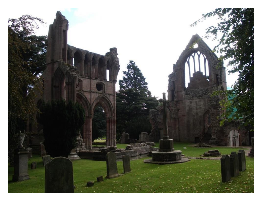
Figure 2. Dryburgh Abbey photographed by Donald Barrett, 1 October 2006.

novelist Sir Walter Scott (1771-1832), one of the most significant innovators in the creation of 'Scottishness', and of "Field Marshall Sir Douglas Haig, commander of the British forces on the Western Front from 1915 until the end of World War I."<sup>36</sup> Haig is a divisive figure in the twenty-first century, but the combination of Scott's literary reputation and Haig's high military standing, magnified by the beauty of the ruins and the fact that an earlier Celtic monastery occupied the site makes Dryburgh Abbey a marvellous candidate for heritage marketing.<sup>37</sup>