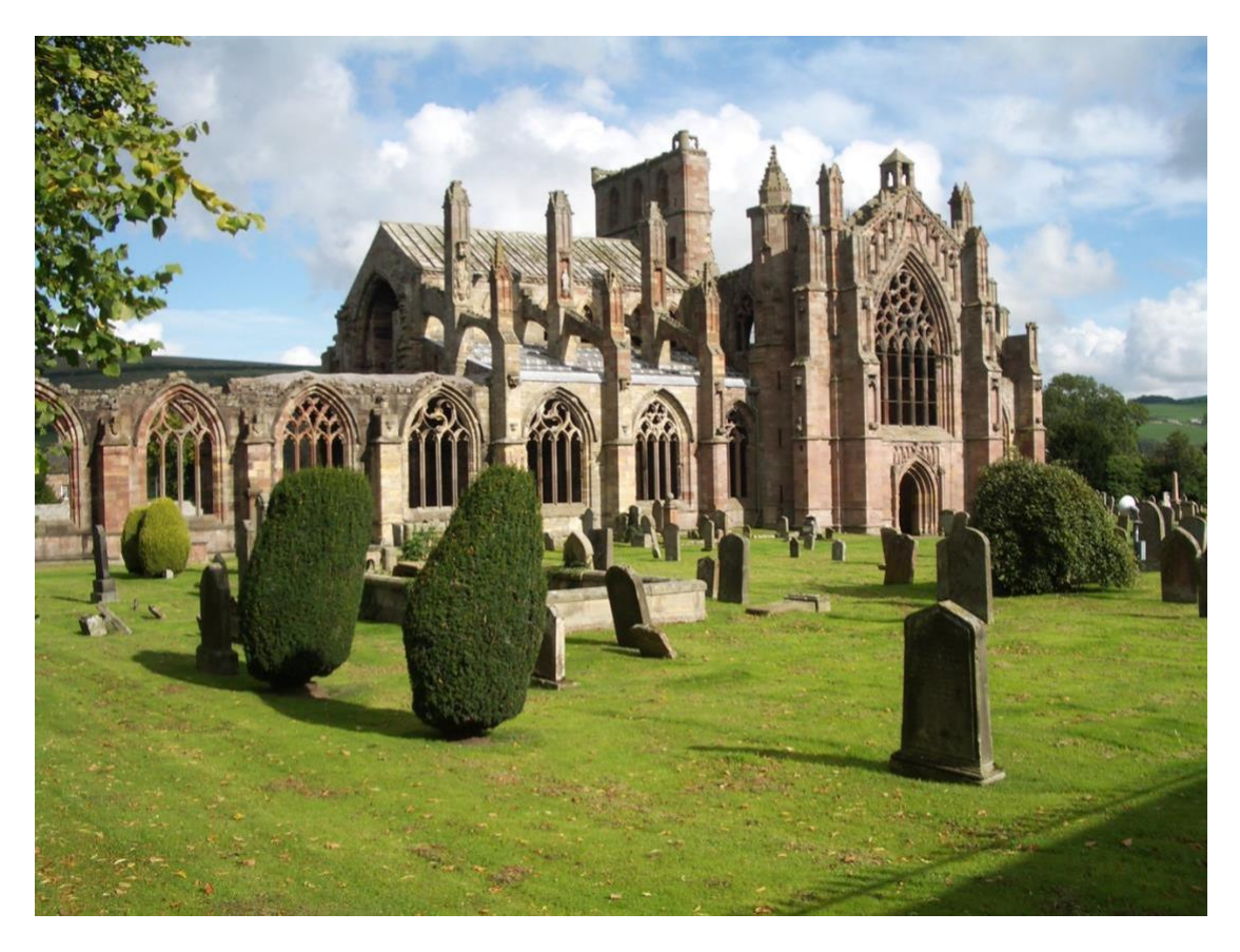
Figure 1. Melrose Abbey, photographed by Donald Barrett, 1 October 2006.

This study analyses the discourses of history, tourism, and identity that are used in the marketing of the Border Abbeys Way, a 68 mile (109 kilometre) heritage walk which was opened in 2006. The Border Abbeys Way is one of Scotland's Grand Trails, and winds between the Tweed and the Teviot Rivers. It intersects with three other long-distance walks: the Southern Upland Way; Saint Cuthbert's Way; and the Cross Borders Drove Road.<sup>2</sup> The featured medieval churches that give the walk its title are Melrose Abbey, Dryburgh Abbey, Kelso Abbey, and Jedburgh Abbey. These great churches were all built during the reign of King David I of Scotland (1084-1153, reigned from 1124), the youngest son of King Malcolm Canmore and Queen (later Saint) Margaret, his Anglo-Saxon wife. David spent much of his youth in the court of his brother-in-law, Henry I of England (who married his elder sister Matilda of Scotland), and wished to bring Scotland into the international church structure and governmental culture he encountered in England.