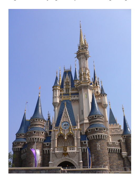
Figure 5 – Cinderella's Magic Castle, Tokyo.