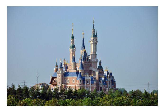
Figure 7 – Enchanted Storybook Castle, Shanghai.

similar close positioning of many towers, turrets and conical caps. The eye is intrigued by the tension between these closely massed shapes that have slight variations and complex visual rhythms. This could be seen as a 'sublime' point of viewing. The Shanghai castle, which was intended to be in some way 'Chinese', has introduced a new European motif, the Baroque from Vienna and Eastern Europe. There is a tower with the ogee-onion shaped curves of German/Eastern churches. This is an innovation, as all previous castles have excluded this category of style. To an extent never before seen, it is an extraordinary full scale built museum of architectural forms (Figure 7).