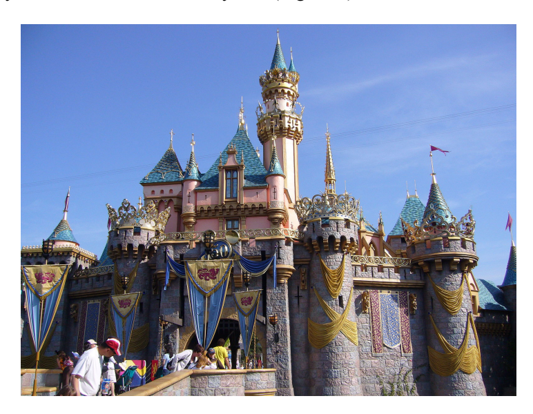
Figure 2 – Sleeping Beauty Castle, Anaheim.

The Neuschwanstein Castle is the most famous inspiration for the Sleeping Beauty Castle at Anaheim Disneyland (Figure 2).<sup>25</sup>