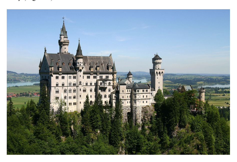
Figure 1 – Neuschwanstein Castle.

The overall effect was dramatic, and it still looks extraordinary today (Figure 1).