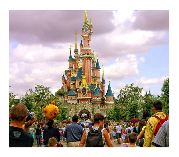
Figure 6 – Sleeping Beauty Castle, Paris.

There was a marked creative development at Disneyland Paris: this was no replica of anything before it. Instead we see a fantastic mix of French Second Empire style motifs applied to greatly simplified medieval forms. The castle is comparatively slender and the high tower is more prominent in relation to lower towers, it is almost a high as the Orlando castle at 51 metres. As at Anaheim, there are towers both round and octagonal, there are turrets and bartizans (Figure 6).