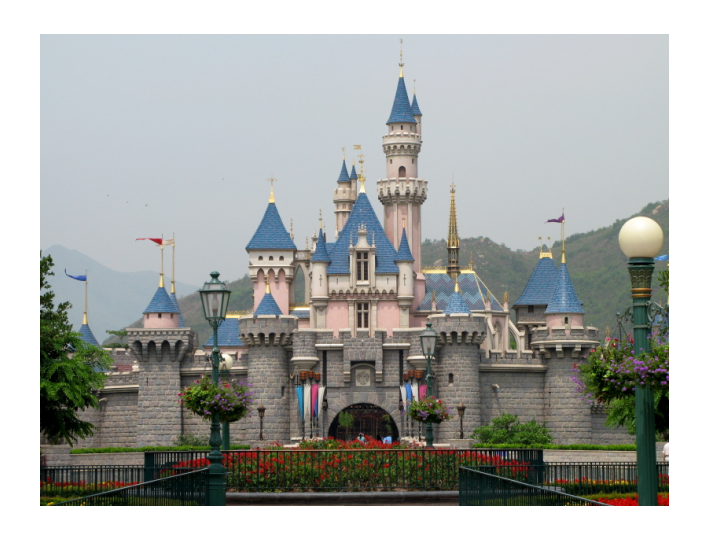
Figure 4 – Sleeping Beauty Castle, Hong Kong.