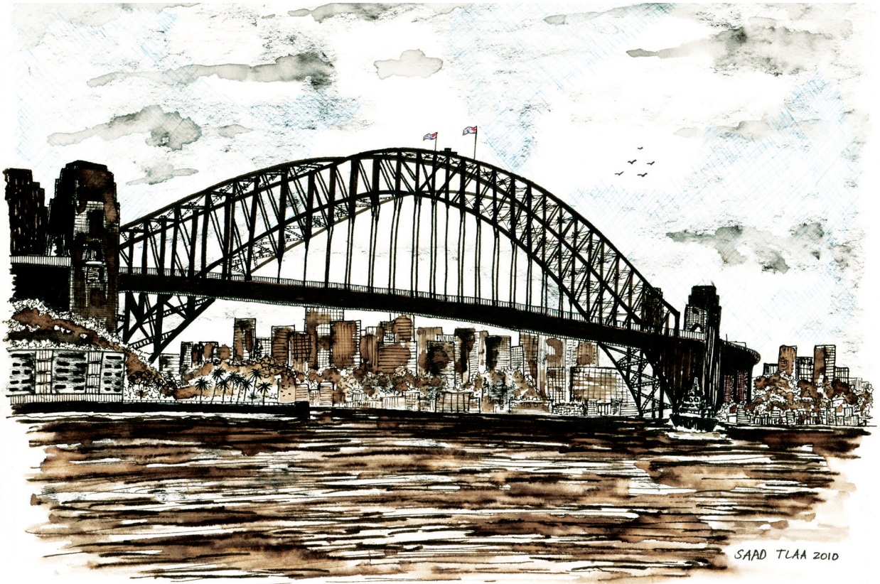
Saad Tlaa, Sydney Harbour Bridge, pen, ink and colour pencils on paper, 29x21cm