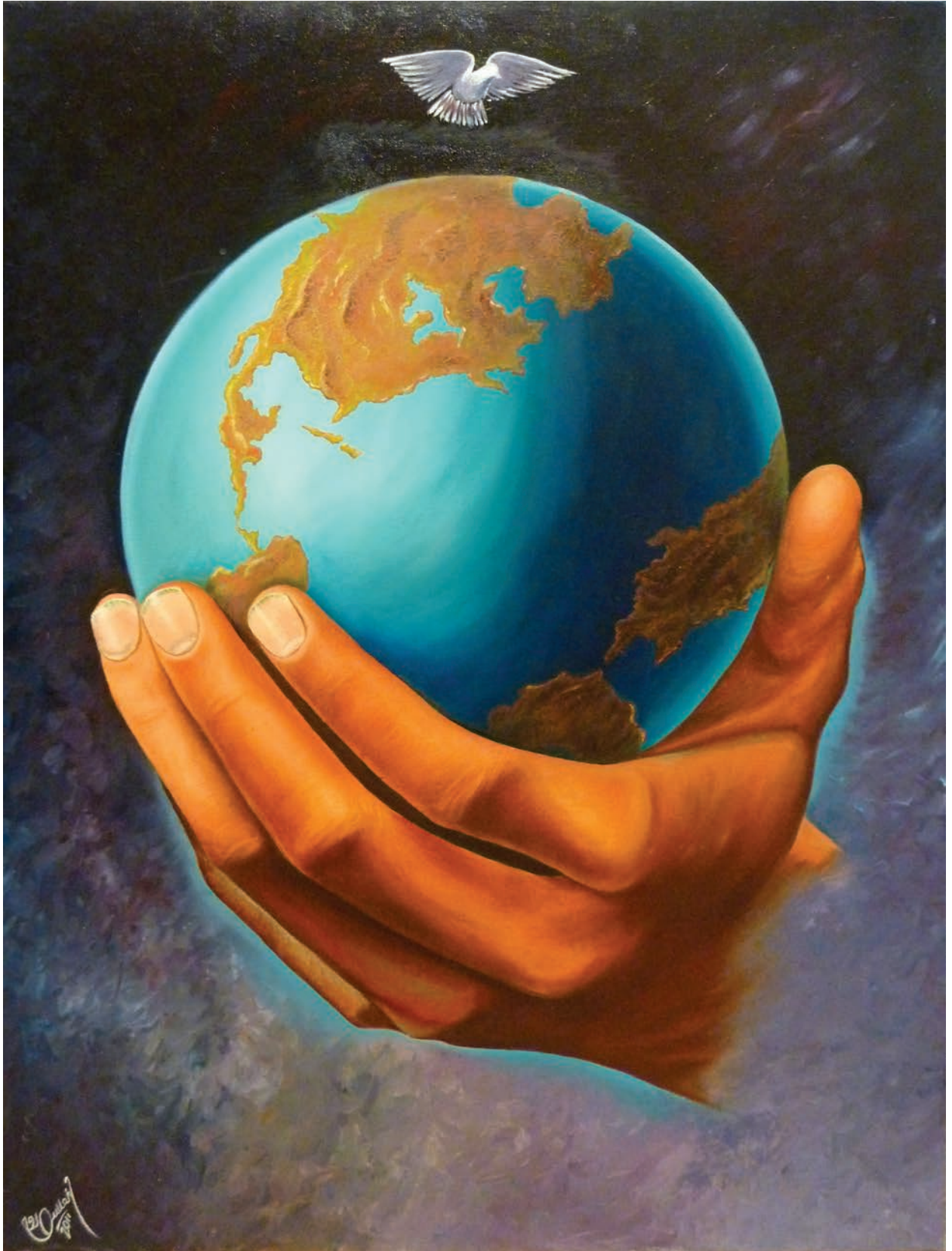
Syed Ruhollah Musavi, Untitled, oil on canvas, 60x69cm