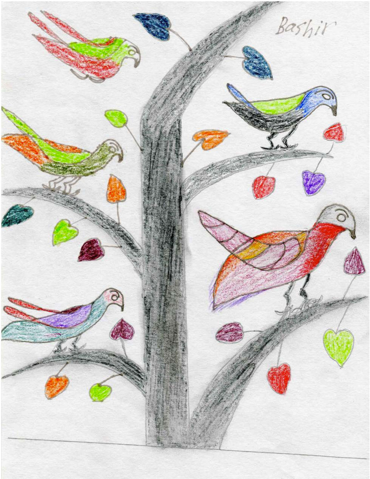
B, Birds of Paradise, pencil on paper, 29x21cm