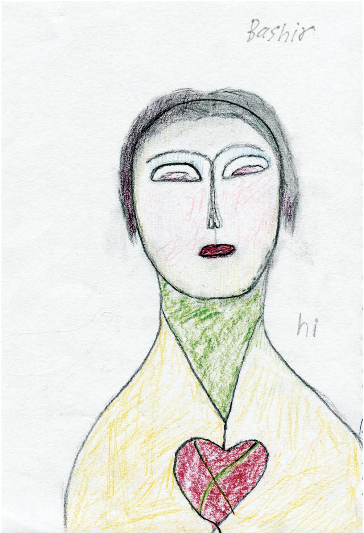
B, Hi, pencil on paper, 29x21cm