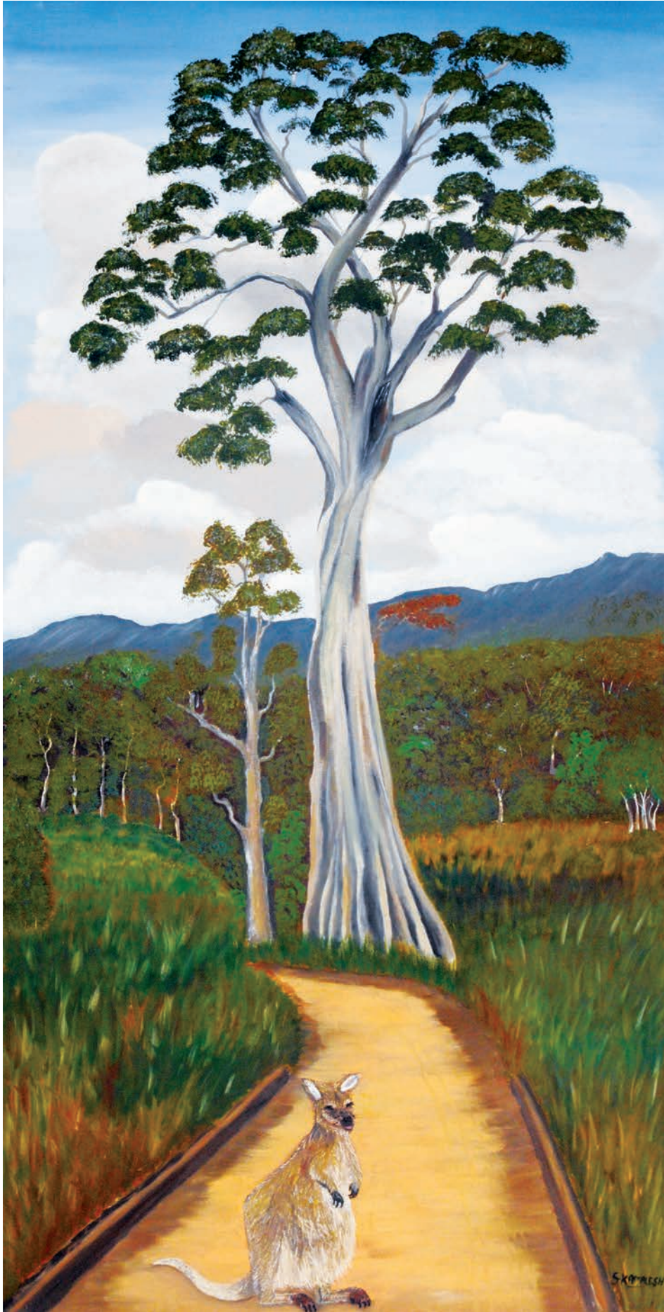
K, Australian Landscape, oil on canvas, 76x151cm