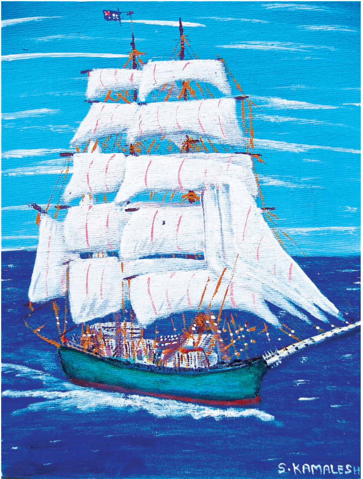
K, First Fleet, oil on canvas board, 28x39cm