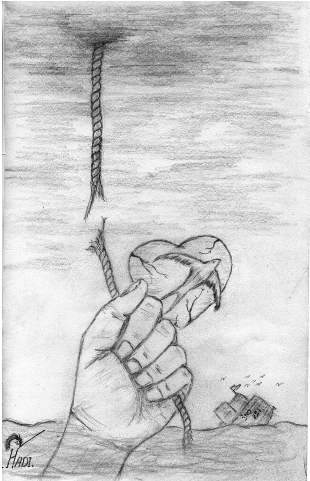
Hadi Baghaei, SIEV 221, pencil on paper, 21x29cm