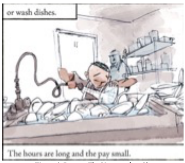
Figure 6: Brown, The Unwanted, p. 52.

individuals who face abuse as children are more likely that non-abused children to continue to be experience abuse throughout their lives. The established political and popular narratives of refugees as "illegal" or "parasites" often exclude the plight of children, as it is far more difficult to justify excluding a child from human rights.