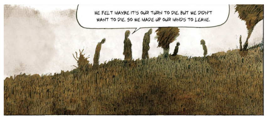
Figure 2: Brown, The Unwanted, p. 15.