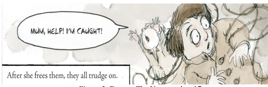
Figure 3: Brown, The Unwanted, p. 17.

Despite these details in illustration, the text unambiguously reframes refugees as human beings entitled to rights and dignity. The images enable a narrative visualisation of what the refugees undergo in their perilous voyage to seek safety in a strange land, especially the day-to-day experiences, which are often absent in depictions. For instance, one panel depicts a woman and her young children foraging for food in a park, with the subsequent panels showing the garbage they are forced to eat; half-bitten apples and bread slices pestered with rats and bugs. Further, Brown does not shy away from depicting the long-term impacts of statelessness and the harsh conditions faced by refugees who are forced into camps (Figures 3 and 4). These representations of refugee experiences challenge the dominant political discourses of refugees as invaders or terrorists.