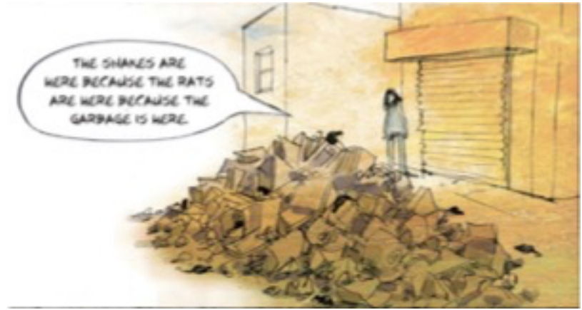
Figure 4: Brown, The Unwanted, p. 59.