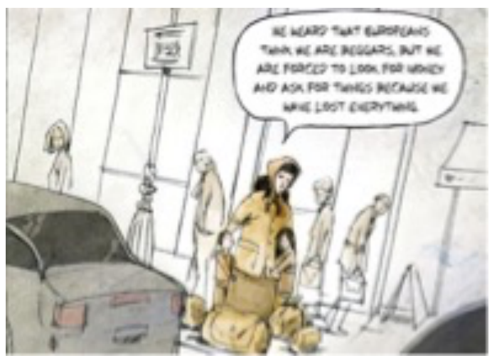
Figure 7: Brown, The Unwanted, p. 45.