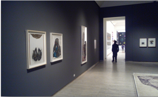
Figure 3: ‘Khadim Ali: the Haunted Lotus’ exhibited at the Art Gallery of New South Wales, 2014

I decide it is time to leave – I step out from behind the walls and everything is blinding – these walls are white and the space is open. The light seems to come from everywhere at once. But still the sound is distant – that changes as I go up the escalators. I turn to watch the deep black painting recede. I can hear the café again, and then after that I can see natural light from a large glass window on the ground floor. And then I’m up top again, and I can see lots of people in the main corridor, and hear people asking attendants questions, and I can hear traffic outside. I can see the sky and the gardens across the road. I am struggling to pull myself up out of that exhibition though, and although everything is suddenly much closer, it is not quite my speed yet. It is not until I am outside the gallery itself and crossing streets (and being hit with a slap of cold air and absolutely blinding brightness on this grey day) that I manage to force myself back into the world. My brain works double-time for a while to catch up with reality. And then I am musing again about the exhibition, but settled. And the experience is over. 21