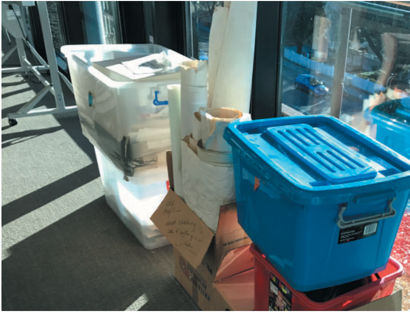
Figure 4. The Costin Collection as found.