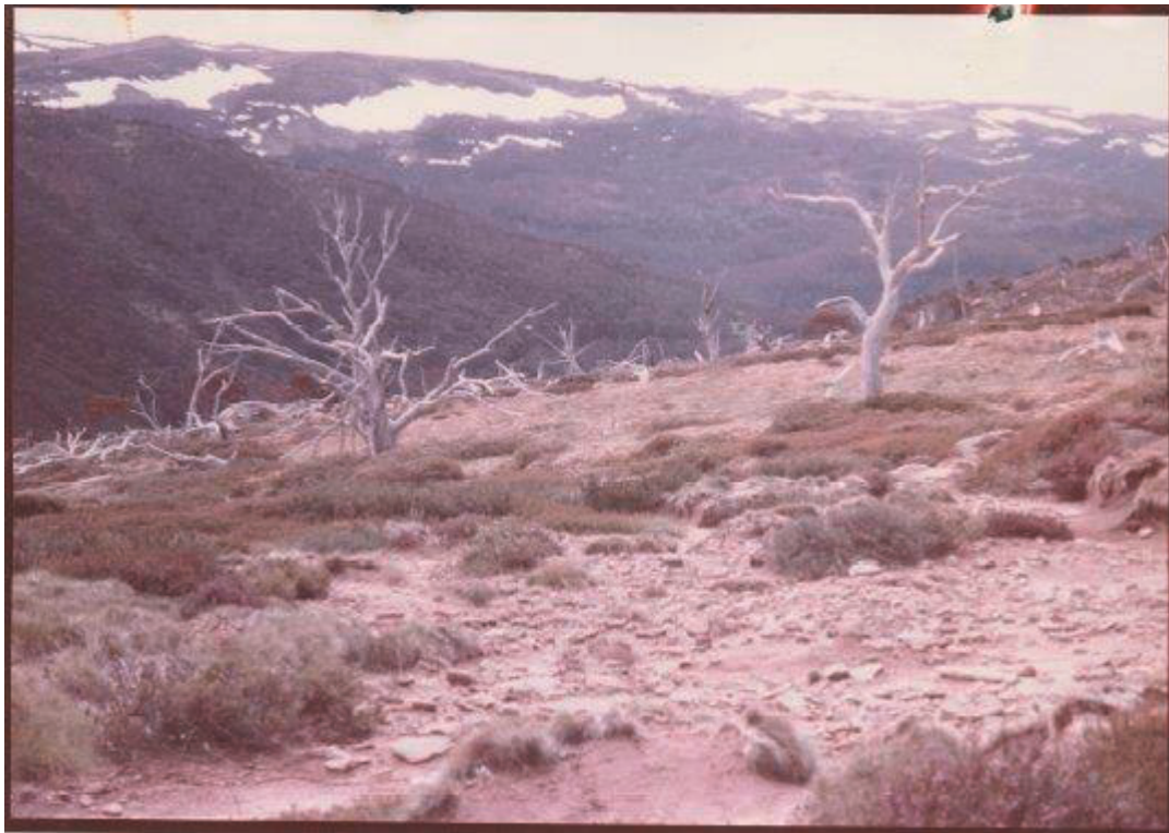
Figure 2. Photo comparison Kosciuszko National Park, burnt snowgum woodland 21 years of recovery.