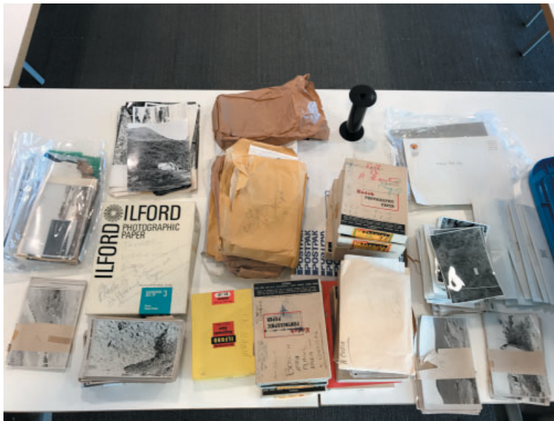
Figure 5. Material sorted in to type for archiving

registered and defined. The final activity in this process is the publication of a web guide.