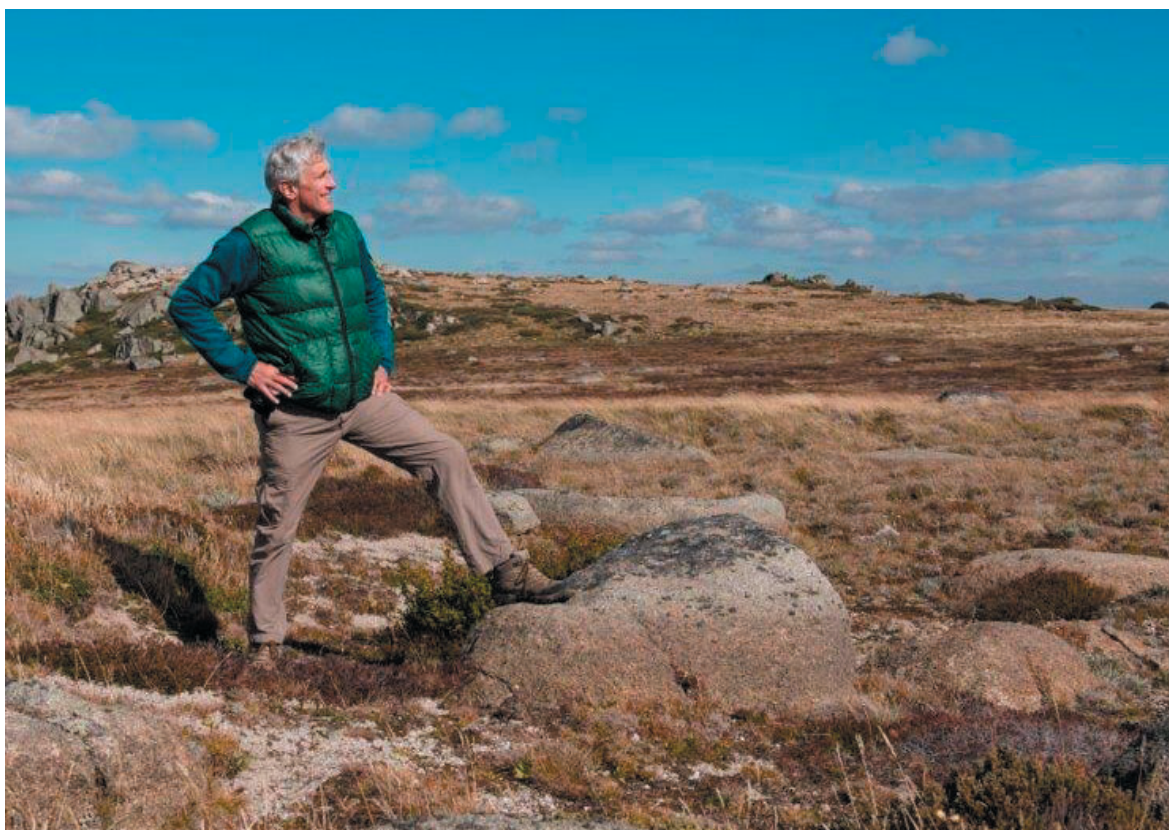
Figure 1. Photo comparison Kosciuszko National Park, Gungartan Range – 60 years of recovery.