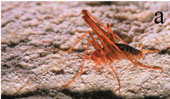
Figure 3 (below). Examples of Jenolan cave fauna, approximate length (including legs) indicated (photographer). a. Cavernotettix cave cricket, 25 mm (Stefan Eberhard); b. Badumna socialis 16 mm (Mike Gray); c. Stiphidion facetum (with dipteran prey), 25 mm (Stefan Eberhard); d. Web of S. facetum (Helen Smith); e. Laetesia weburdi , 5 mm (Mike Gray); f. Holonuncia cave harvestman, 20 mm (Stefan Eberhard).