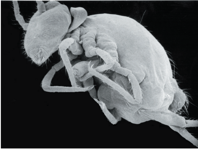
Figure 2 (left). Scanning electron micrograph of Adelphoderia sp., < 1 mm (Penelope Greenslade)