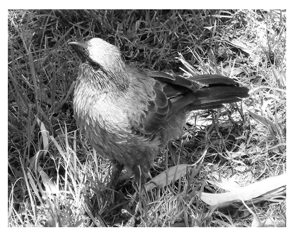
Figure 1. An apostlebird Struthidea cinerea at the Pinegrove Lawn Cemetery, Minchinbury.

The apostlebird ( Struthidea cinerea ) (Fig. 1), a conspicuous gregarious passerine, is abundant in the inland areas of eastern Australia, with an isolated population in the Top End, Northern Territory (Fig. 2). Changes in the distribution in last century were well-documented, showing that at least half its current range was penetrated in the last 100 years (McAllan and O'Brien 2001; Barrett et al. 2003). Habitation of some localities apparently occurs in response to climatic conditions, receding in times of drought (Mack 1967).