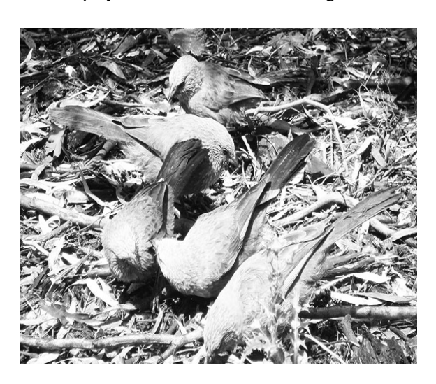
Figure 4. A flock of five apostlebirds Struthidea cinerea in Nurragingy Reserve, Doonside.

1964) demonstrate the possibility of coastal urban populations forming in Sydney. Being a mudnester, the climate of the eastern seaboard may perhaps facilitate its breeding by the continuous availability of damp soil and reliable rainfall. In addition, urban environments present fewer natural predators such as birds of prey and monitor lizards. Although domestic