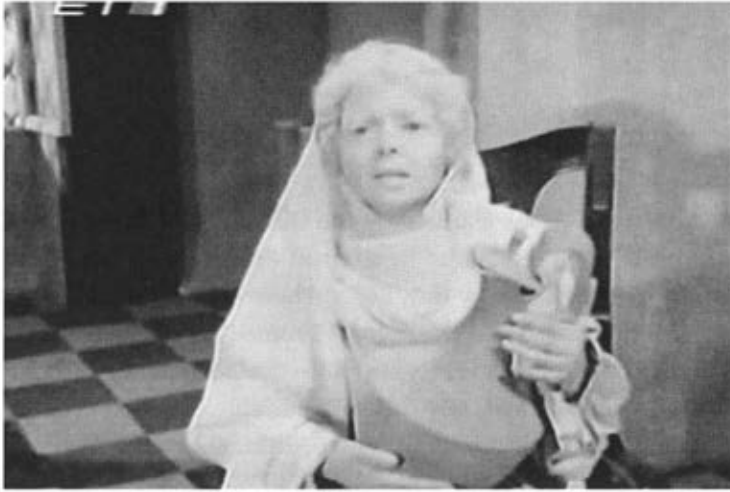
The Duchess of Placentia : snapshot taken from the DVD

It seems that Plyta in order to confront the stereotype of women as fallen angels in a brothel or a night club, waiting for a strong man to liberate them from their inability to freeing themselves, went the other direction and constructed the idealistic and completely super-human image of women as unfallen angels, as angels who could not fall and would never allow themselves to be 'saved' by the grace of their husband. Certainly this image was the outcome of a long process within the representational codes of the industry; it was the ultimate construct of her films in the last years of her productivity, especially in films like The Uphill Road/O Aniforos (1964), The Winner (1965) and The Little Trader (1967), melodramas in which the female protagonist carries the burden of the story till the end and frames the complexities that make the script unfold in unexpected narrative twists and turns.