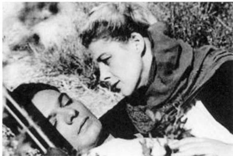
The She-Wolf : snapshot taken from the DVD

Furthermore, her films refocused the epicentre of dramatic tension from the actions of powerful men to the bodies of energetic, assertive and sometimes eccentric women. From the first film of her own The She-Wolf/Lykaina (1951) to her last The Unknown Woman of the Night (1970) the epicentre of narrative action became the resolute, strong-willed and passionate female presence which disrupts the expectations and the habits of the spectator.