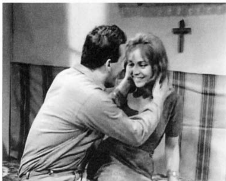
The Little Shoeshine Boy : snapshot taken from the DVD

The most obvious example also can be found in her superb melodrama The Little Shoeshine Boy/O Loustrakos , when the two youths embrace in passion ready to have sex, then suddenly a cross appears hanging on the wall, symbolising the sanctity of marriage that could make sexual intercourse possible.