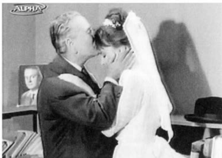
The Uphill Road : snapshot from the DVD

an age of rapid capitalist expansion. As Jacques Lacan has indicated: 'It is in the name of the Father that we must recognize the support of the symbolic function which, from the dawn of history, has identified his person with the figure of the law,' (Lacan, 1997: 67).