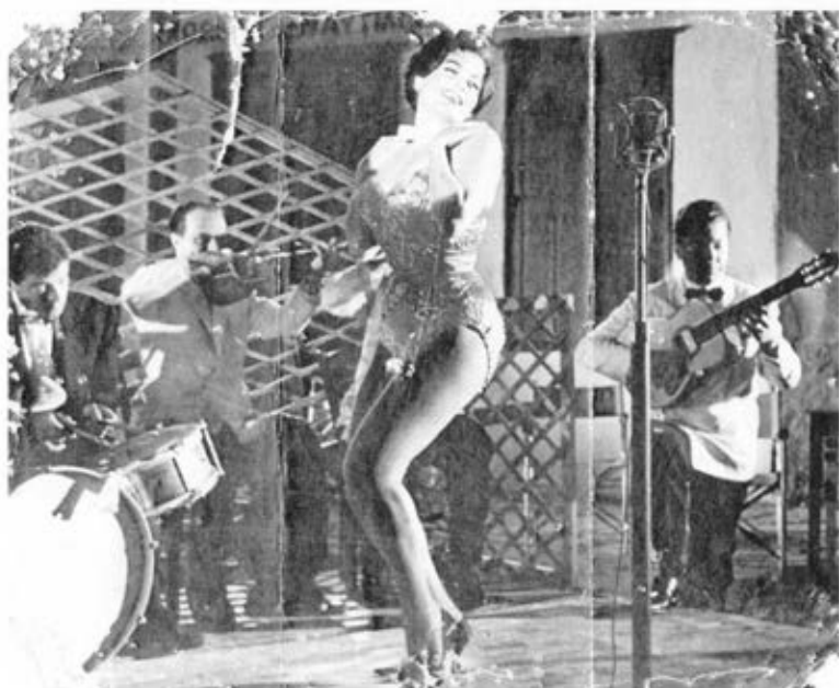
The Prodigal : snapshot from the DVD

the female gaze unabashedly objectifies the male body, especially in Eve/Eva (1953), or renders it totally angelic, pure and desexualised as in the late melodramas, like, The Prodigal/ O Asotos (1963), The Winner/ O Nikitis (1965) and The Little Trader/ O Emporakos (1967)—the so-called social trilogy. The important thing is that the director herself constructs a pictorial space in which the female perspective dominates the visual field and makes the spatial arrangements that impose a different order of things, emotions and expectations. The female perspective asserts itself through an implied but distinct feminisation of men. Masculine figures lose their inflexibility and authority and are changed and transformed; while women are the victims of prejudice and exclusion, men become also victims of their class—either poor or wealthy they are equally impotent in coping with the pressures of society. Through such reversals, the aggressive and domineering male figure shrinks and makes room for an equally assertive presence, embodied by the female character. Within the production of the period, her style seems that have inaugurated an interesting conversation between her and other filmmakers, expressed through the way that she used the same actors.