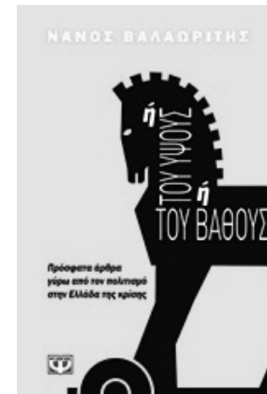
Image 1. The cover of the book Either of the Height or of the Depth: Recent Articles on Civilization in Greece of the Crisis (Psychogios, 2013).

that comprises a full array of seemingly disparate articles, ranging from analysis of the current events in crisis-hit Greece to Surrealism and its main representatives in Greece. More specifically, besides its polemic and witty tone, one notices the loaded key-concepts and rhetorical devices and parallelisms that the author uses: the metaphor of the Homeric Trojan Horse with its dangerous cargo projected to today’s Greek debts and loans after a transition through the uprisings of the heroes of the Greek Revolution, ready to loot Europe. Also the mistrust in the relationship between the Europeans and the Greeks is well-established in this metaphor which yet takes on another form, even more powerful according to the author, and that is the possibility that amidst the cargo of the Trojan Horse may also be poets who fight with language and who hold the true image of the Greeks. After distinguishing between the two kinds of perceivers of the “Greeks”, the true ones such as the poets and the incompetent scoundrels who machinate among us, he hints to the latter as the Germans who then are directly attacked as “greedy, blood-thirsty ‘Christian’ barons of the North.” Finally, he suggests that there are other, more reliant allies with whom the Greeks could possibly establish all kinds of alliances, liberating themselves from the tyranny of the so-called Troika.