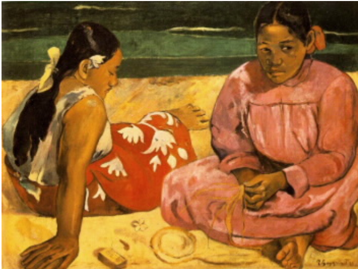
Paul Gauguin, Tahitian Women [ Femme de Tahiti ], 1891

Eleanor captures the same mixture of tropical labour and indolence supposed by the modern primitivism of Paul Gauguin.