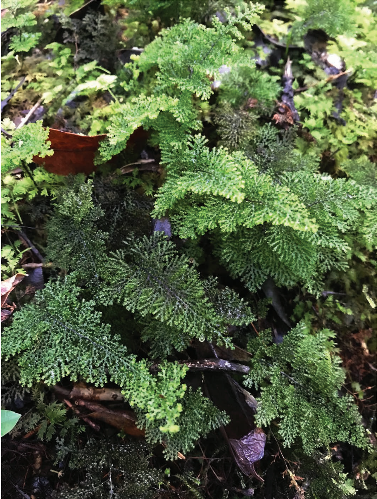
Fig. 1. Hymenophyllum reinwardtii in situ on Mt Finnigan.

of Mt Finnigan (Fig. 1). The nearly glabrous rhizomes, pinnate fronds, and glabrous stipes put the plant in Hymenophyllum subg. Globosa (Prantl) Ebihara & K.Iwats. (Ebihara et al. 2006), and corresponded with H. reinwardtii Bosch among species of this subgenus listed by Ebihara et al. (2010). This identification was confirmed against herbarium material and images of type specimens, making this the first record of the Malesian Hymenophyllum reinwardtii for Australia.