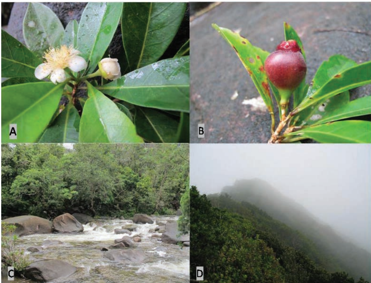
Fig. 1. Rhodomyrtus verecunda . A. Habit of flowering branchlet; B. Mature fruit and leaves with purple petioles; C. Riparian habitat along Noah Creek; D. Wind-sheared ridge habitat on Mt Sorrow.

Distribution: Rhodomyrtus verecunda is endemic to the Wet Tropics bioregion (Department of Environment 2012) in north-eastern Queensland, Australia, where it is currently only known from a restricted area in the very high rainfall zone (>3000 mm per annum) between the Daintree River, Cape Tribulation and Mt Pieter Botte (north of Cairns) (Fig. 2).