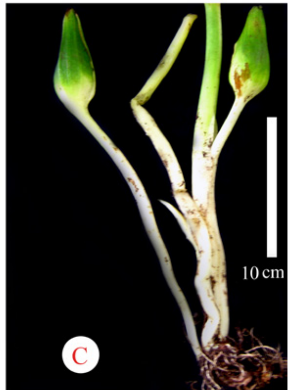
Plate 1. Sauromatum horsfieldii Miq.: A. Plant in situ ; B. Inflorescences; C. Lower half of Plant.