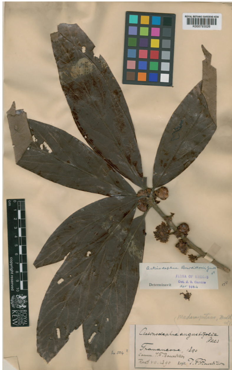
Fig. 1. Lectotype of Actinodaphne bourdillonii (K000793026, Reproduced with the consent of the Royal Botanic Gardens, Kew).