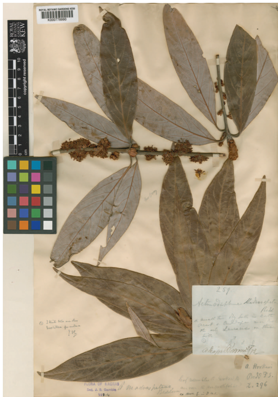
Fig. 7. Lectotype of Actinodaphne madraspatana (K000778990,).