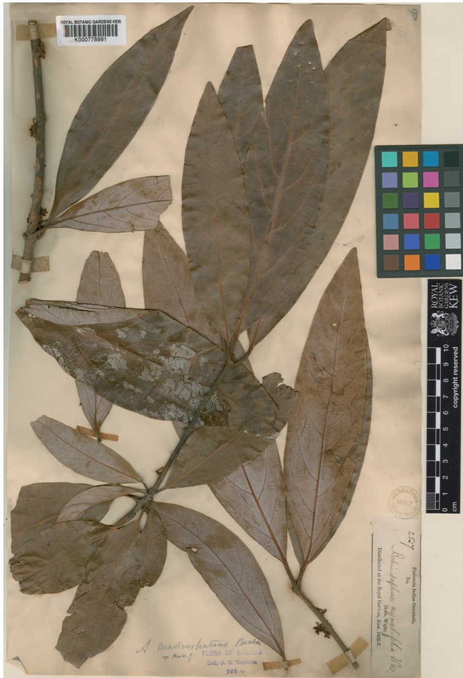
Fig. 8. Lectotype of Actinodaphne hookeri Meisn. var. longifolia (K000778991,)