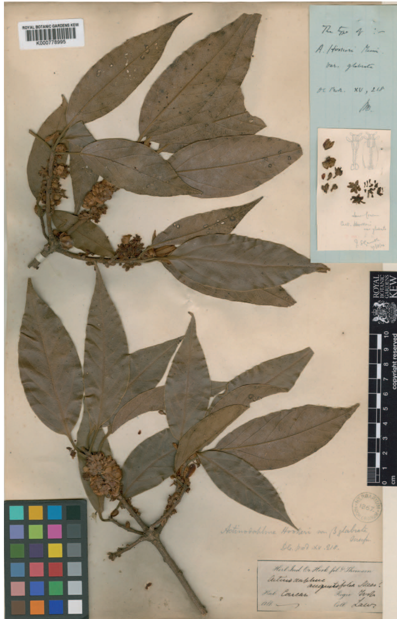
Fig. 5. Lectotype of Actinodaphne hookeri var. glabrata (K000778995,).