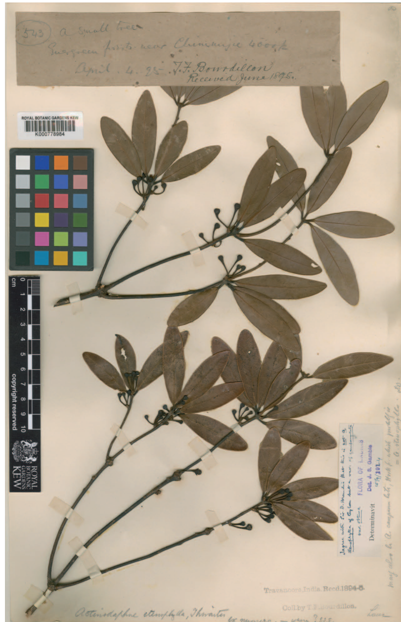
Fig. 3. Lectotype of Actinodaphne campanulata var. obtusata (K000778984,).