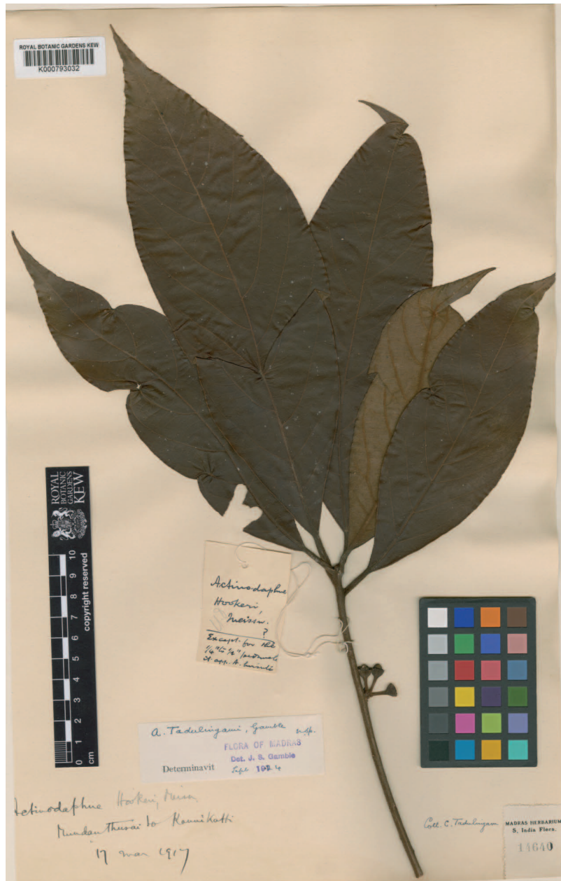
Fig. 10. Lectotype of Actinodaphne tadulingamii (K000793032,).