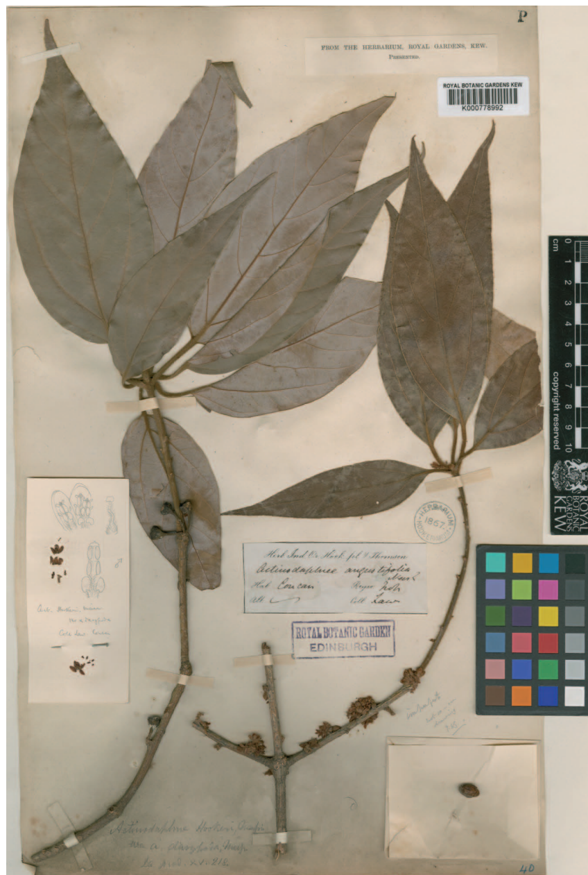
Fig. 4. Lectotype of Actinodaphne hookeri (K000778992)