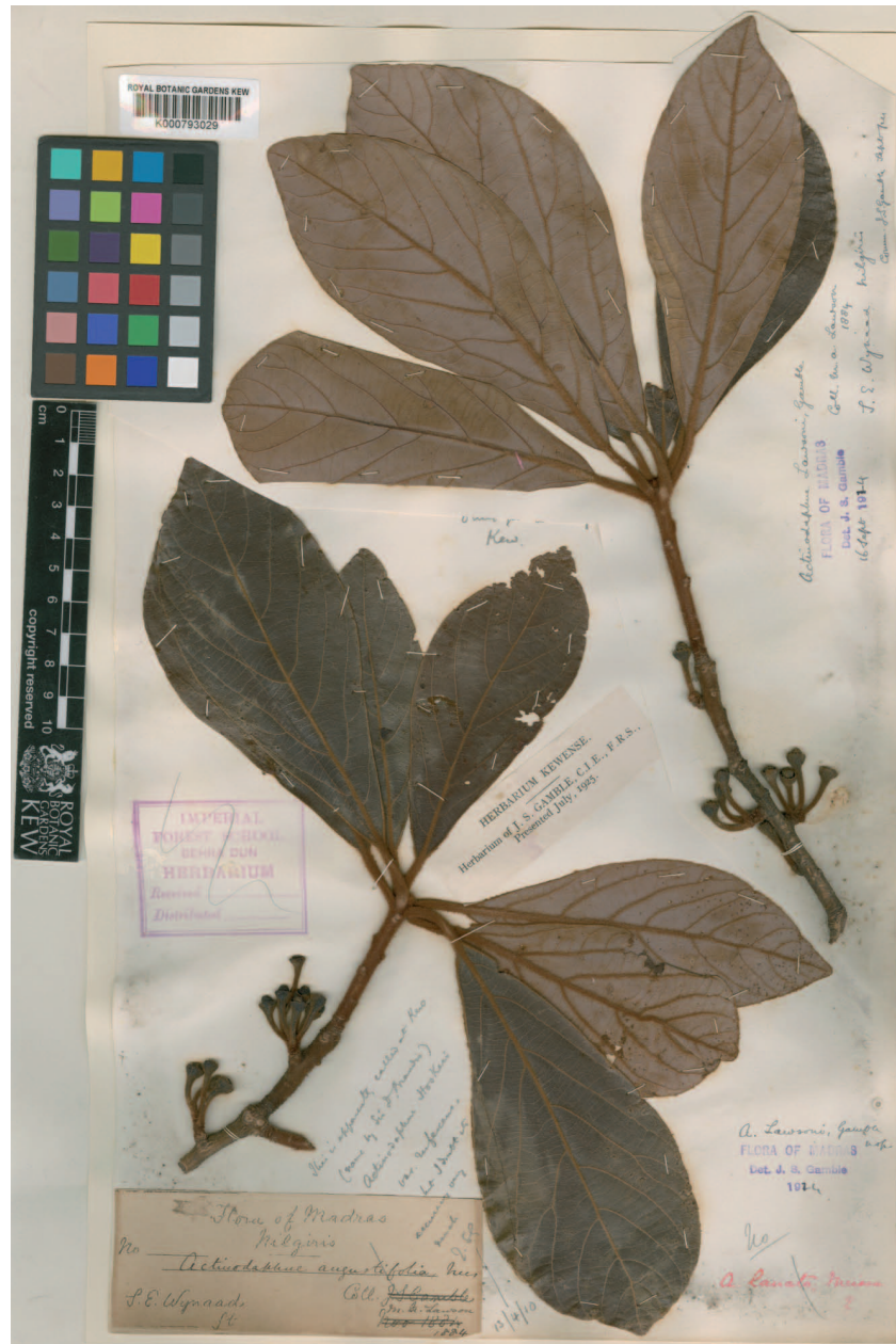
Fig. 6. Lectotype of Actinodaphne lawsonii (K000793029, Reproduced with the consent of the Royal Botanic Gardens, Kew).