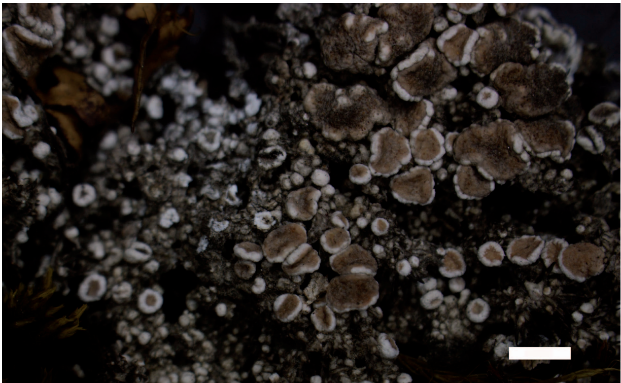
Fig. 2. Pertusaria montana (holotype). Image showing a muscicolous thallus and disciform apothecia with epruinose or slightly pruinose, pink disc. Scale bar = 2 mm.

Comments: Pertusaria montana resembles P. bryontha both in general appearance and habitat. Both are arctic-alpine species growing on mosses and plant debris and contain one ascospore per ascus. Pertusaria bryontha has a dark brown disc, contains stictic acid and its epihymenium is K+ purple (Chambers et al. 2009) whereas the new species has a pink disc, lacks stictic acid and has a K- epihymenium.