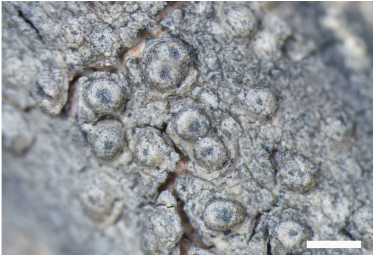
Fig. 3. Pertusaria yulongensis (holotype). Image showing verruciform apothecia with concave, black apices. Scale bar = 1 mm.

Additional specimen examined: CHINA: YUNNAN: Yulong County, Lidiping, alt. 3250 m, on branch, J. X. Xi 0159(h), 16 Jun 1984 (KUN 11537).