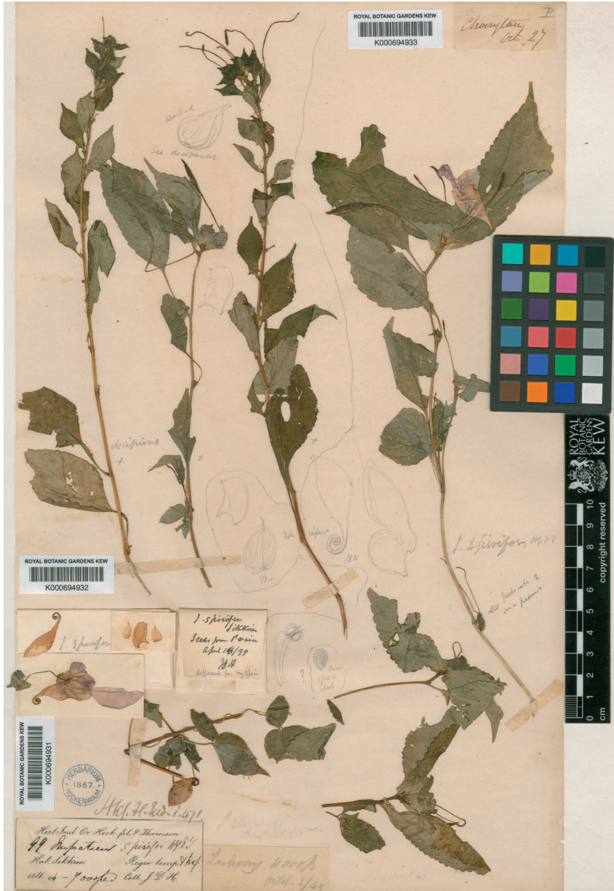
Fig. 1. Lectotype of Impatiens spirifera Hook.f. & Thomson (K000694933! http://specimens.kew.org/herbarium/K000694933)