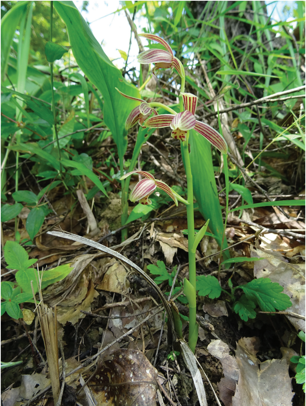
Fig. 1. Cymbidium nanulum flowering in situ . (Photographed in Senapati district, Manipur by V. Kumar).