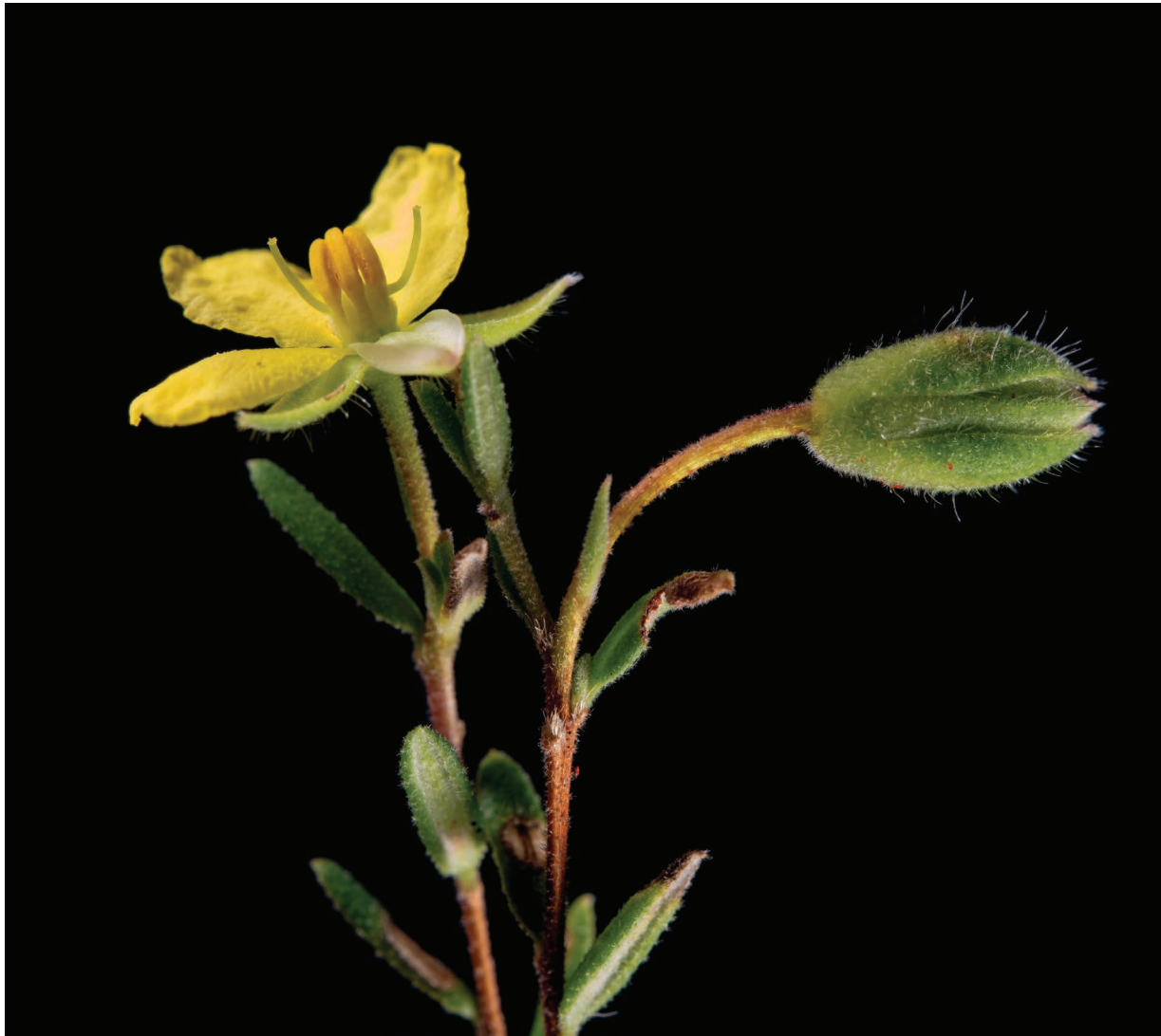
Fig. 2. Hibbertia fumana . Flower and bud, showing pedunculate flowers and fascicled hairs.