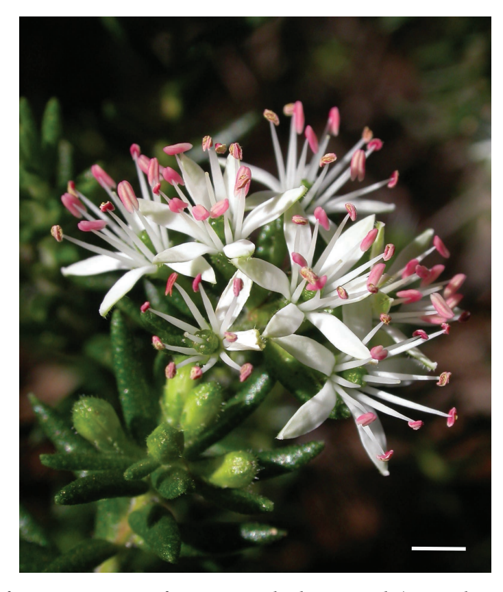
Fig. 2. Inflorescence of Leionema westonii ; from L.M.Copeland 3741 et al. (type gathering). Image by J.J. Bruhl. Scale bar = 2 mm.

Distribution: Leionema westonii occurs in the New England Bioregion (Department of the Environment 2013) where the species is known only from Oxley Wild Rivers National Park (Fig. 3). This area includes much of the Macleay Gorges system on the eastern fall from the New England Tableland, New South Wales. The single known population of L. westonii occurs towards the southern end of the park near Steep Drop Falls approximately 40 km ENE of Walcha.