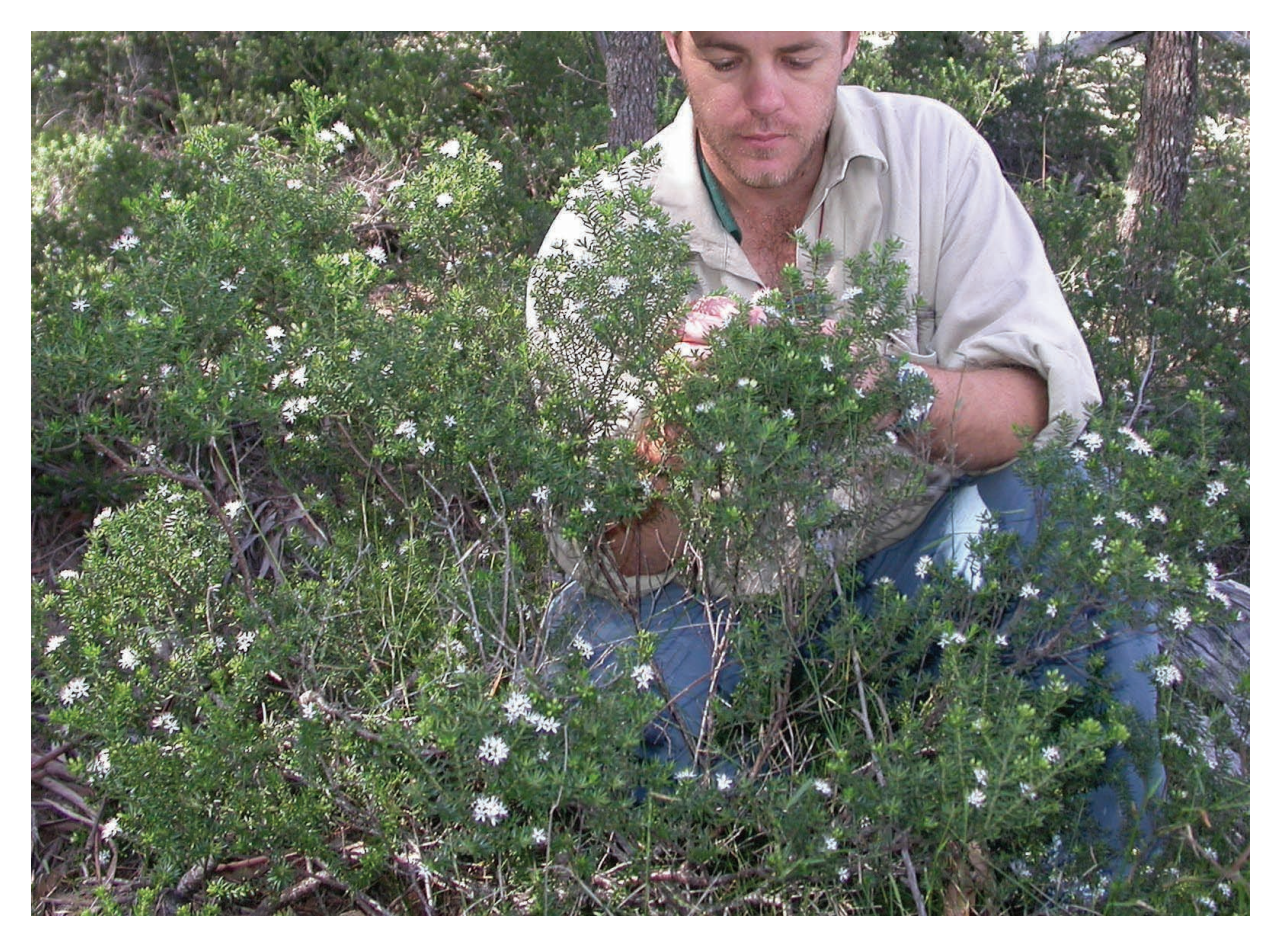
Fig. 1. Habit of Leionema westonii, L.M. Copeland 3741 et al. (type gathering). Image by J.Bruhl.

Shrub, rhizomatous and much-branched, to 70 cm tall. Stems pilose with spreading white simple hairs. Leaves : petiole 1–1.4 mm long, sparsely pilose; lamina narrowly elliptic or linear, 6–16 mm long, 1–1.8 mm wide, obtuse, revolute, adaxially pilose, abaxially minutely white-papillose and sparsely pilose. Inflorescence a terminal cyme composed of 4–10 solitary flowers in the upper axils. Pedicels 3–5.5 mm long, pilose, bearing a subulate, pilose bracteole 2.4–2.8 mm long just below the calyx. Calyx cup-shaped, 1.3–1.6 mm long, sparsely hispidulous, sometimes with minute stellate hairs, 5-toothed, the teeth triangular, c.1 mm long. Petals 5, spreading, narrowly elliptic, 4–4.6 mm long, 1–1.2 mm wide, acute, glabrous adaxially, glandular punctate and sparsely and shortly pilose abaxially, white. Stamens 10, exerted, spreading; filaments terete, 4–4.6 mm long, glabrous, white; anthers elliptic, 1–1.5 mm long, pink. Disc annular surrounding a gynophore c. 0.5 mm long, dark green. Ovary of 5 carpels, fused for most of their length, c. 1 mm long, 0.7 mm diam., papillose, green; style terete, 2.5–2.8 mm long, white; stigma capitate, white. Fruit and seeds not seen. Figs. 1, 2 .