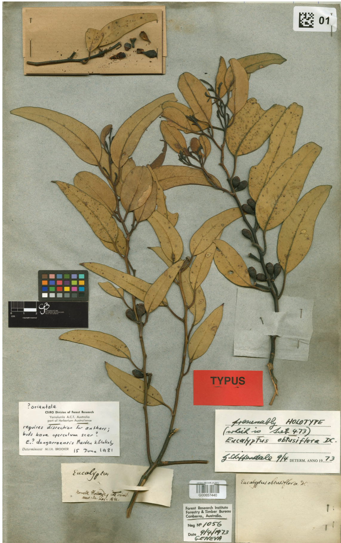
Fig. 2. The holotype of Eucalyptus obtusiflora held in G-DC (sheet G00657440). Note that the right-hand branchlet matches the plate illustrated in de Candolle's Mémoire sur la famille des Myrtacées (see Fig. 1).