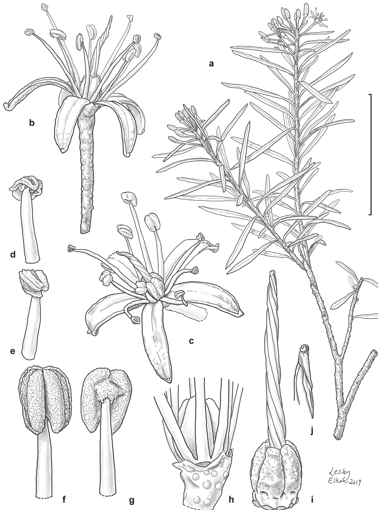
Fig. 1. Leonema praetermissum : a - habit; b - flower, side view; c - flower, \frac{3}{4} view; d - antesealous anther, abaxial view; e - antesealous anther, adaxial view; f - antepetalous anther, adaxial view; g - antepetalous anther, abaxial view; h - calyx, base of stamens and gynoecium detail; i - gynoecium; j - stigma detail. a-j - Weston 2432 & Rodd (NSW). Scale bar = 50 mm for a; 7.5 mm for b & c; 2 mm for d - g & j; 3.3 mm for h & i. Illustration: L. Elkan.