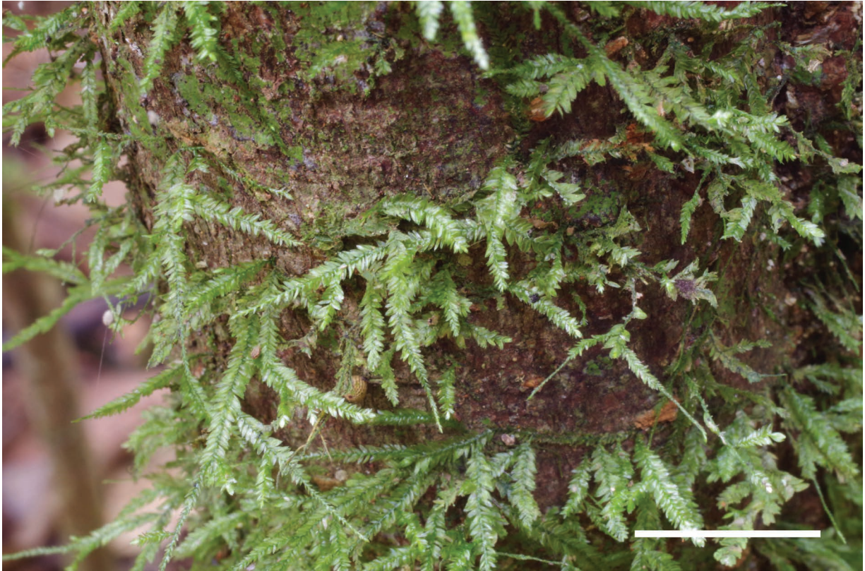
Fig. 3. Camptochaete subporotrichoides (Meagher & Cairns WT-379), showing flattened leaves on all stem sectors. Scale bar: 10 mm.