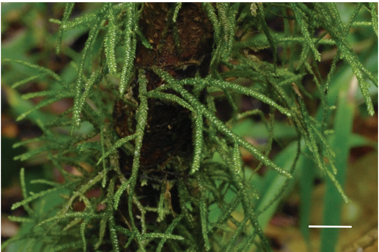
Fig. 4. Camptochaete excavata (Meagher & Cairns WT-205), showing the mostly strongly concave leaves, slightly flattened in some stem sectors. Scale bar: 10 mm.