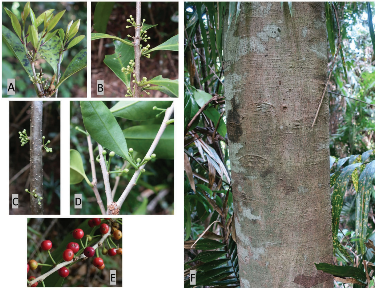
Fig. 1. Ilex corymbosa . A. Male inflorescence habit and showing purple petioles on new growth. B. Male inflorescence habit on one year old twigs. C. Ramiflorous male inflorescence and showing white lenticels on three year old branchlets. D. Female inflorescence habit. E. Mature fruit. F. Trunk from a canopy tree 30 cm dbh. (Photo credits; A: Rigel Jensen; E: Wendy Cooper; B, C, D and F: Andrew Ford).

Diagnosis: Ilex corymbosa differs from Ilex arnhemensis by having: puberulent leafy twigs ( vs glabrous), shorter corolla lobes in male flowers (1.9–2.9 vs 3.2–4 mm long), shorter filaments in male flowers (0.8–1.9 vs c. 2.5 mm long), staminodes present in female flowers ( vs absent), corolla well-formed in female flowers ( vs vestigial), inflorescences fasciculate ( vs non-fasciculate), fruit red ( vs green-cream) and fewer number of pyrenes per fruit (4–6 vs 12–16).