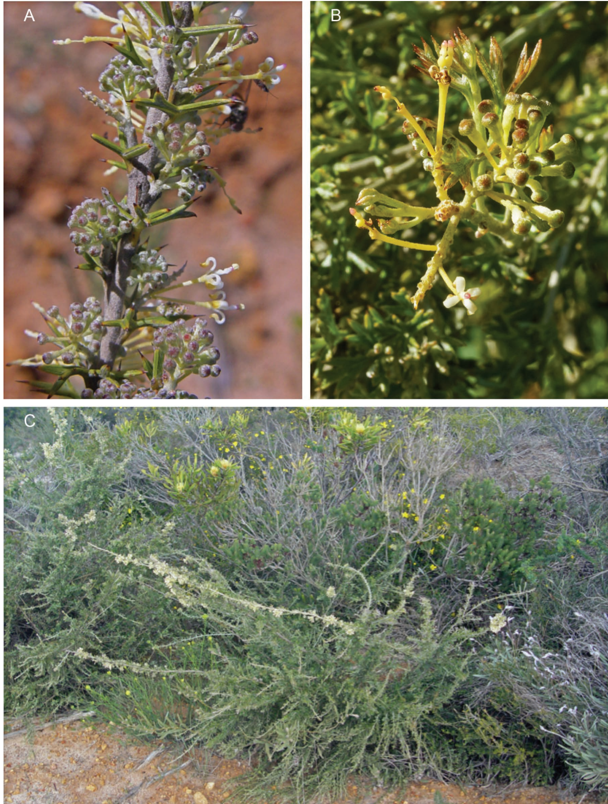
Fig. 1. a. Flowering branchlet of Grevillea trichantha . b. New growth of Grevillea trichantha . c. Grevillea trichantha in natural habitat.

monospermous, 10 mm long, 6 mm wide, oblong-ellipsoidal, transverse to very oblique on incurved pedicel with attachment subposterior, 2–3 mm from base on dorsal side; fructual style oblique; fructual pollen-presenter conical; pericarp 0.5–0.7 mm thick along the suture, thicker at the ends; exocarp smooth; mesocarp crustaceous; endocarp smooth. Seeds not seen. (Figures 1, 2)