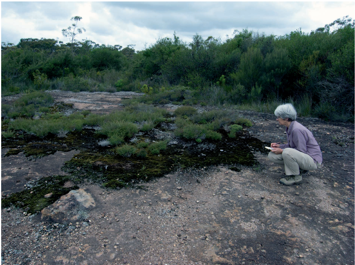
Fig. 3. Typical habitat of Calandrinia petrophila = M.Fagg (West 5554)