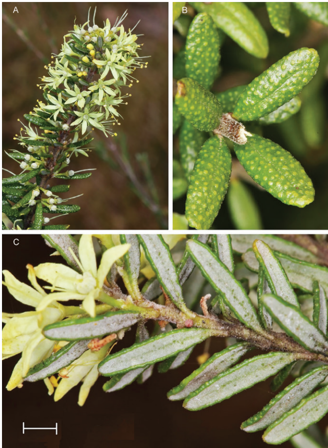
Fig. 1. Leionema paulii . A. Typical flowering branch. B. Leaf adaxial surface showing the distinctive glandular-verrucose surface. C. Leaf abaxial surface. Voucher: G.P. Phillips 944 (NSW). Scale bars: A, 12 mm; B, 2 mm; C, 3.5 mm.