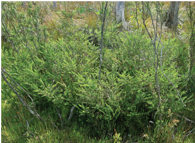
Fig. 2. Leionema paulii at the type location, South East Forest National Park near Bombala, New South Wales.

Additional Specimens Examined: AUSTRALIA: New South Wales: Southern Tablelands: South East Forest National Park, Nunnock Swamp, on isthmus on western side, 20 Dec 2020, G.P. Phillips 1349 & J.M. Cohen (NSW, MEL, CANB, BRI, AD).